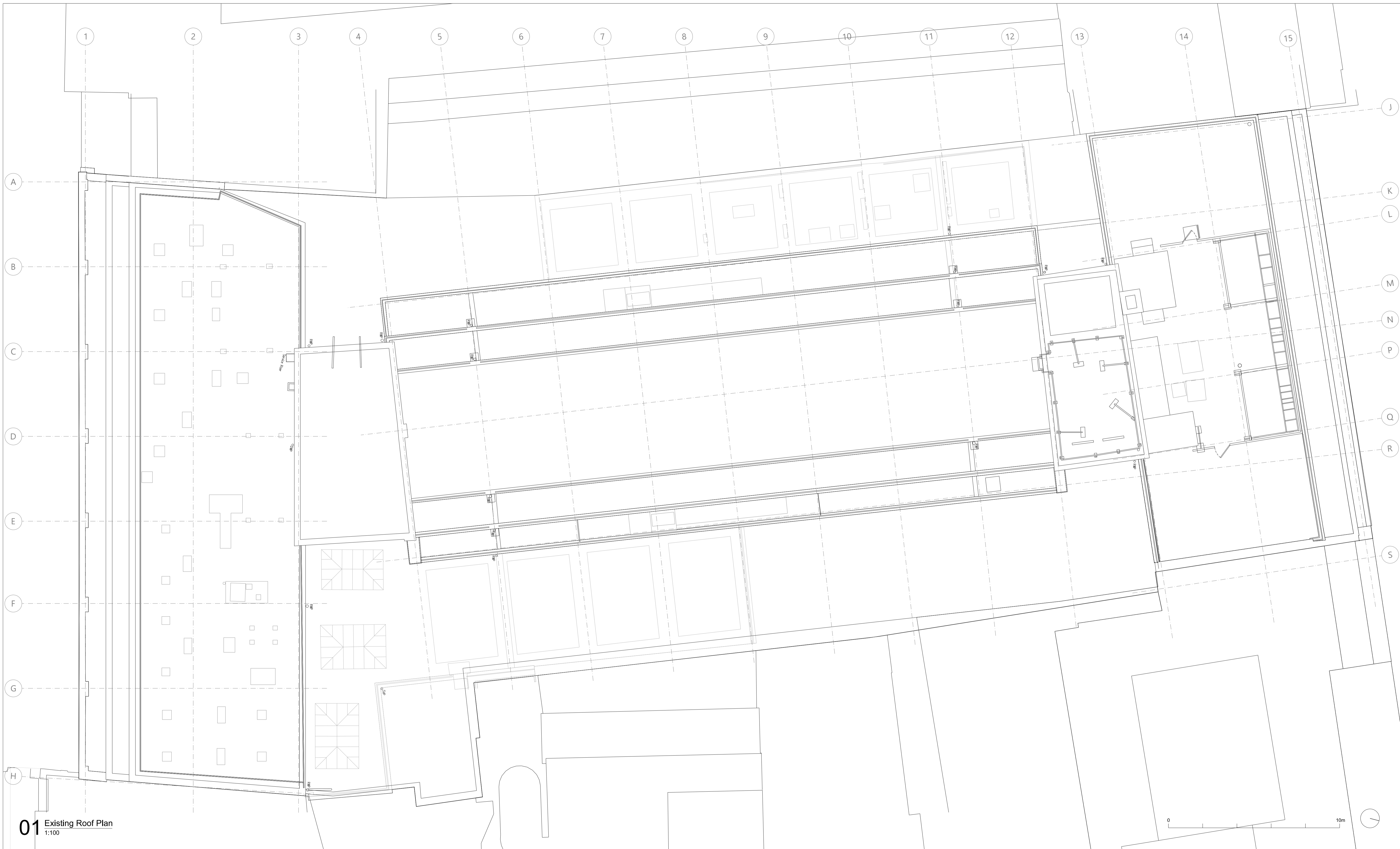
01 Existing Roof Plan 1:100

Copyright Cousins&Cousins Architects. No Implied license exists. This drawing should not be used to calculate areas for the purposes of valuation. All dimensions be checked on site by the contractor and such dimensions to be their responsibility. Do not scale drawings. All work must comply with relevant British Standards and Building Regulations requirements. Drawing errors and omissions to be reported to the architect.