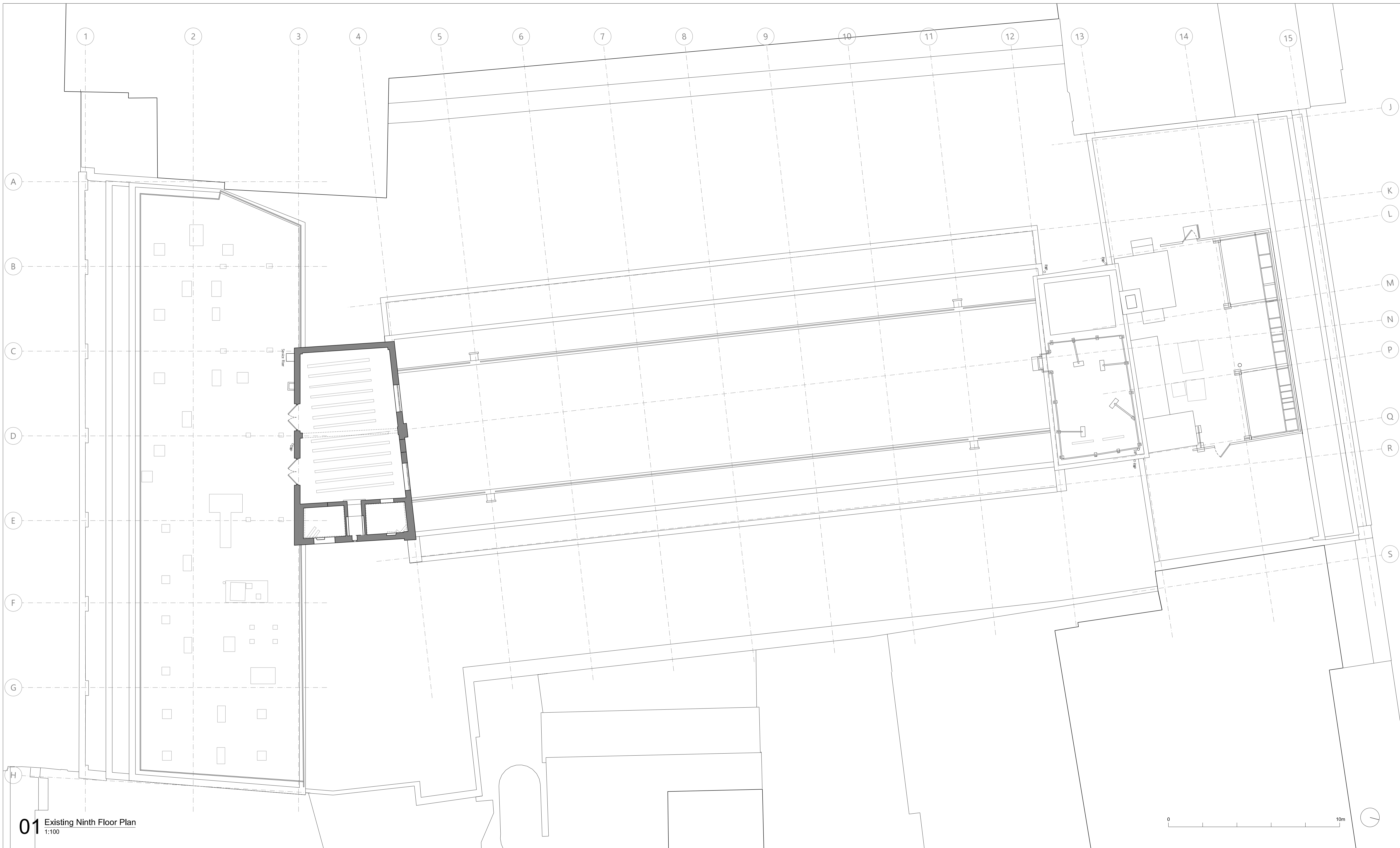
01 Existing Ninth Floor Plan 1:100

Copyright Cousins&Cousins Architects. No implied license exists. This drawing should not be used to calculate areas for the purposes of valuation. All dimensions be checked on site by the contractor and such dimensions to be their responsibility. Do not scale drawings. All work must comply with relevant British Standards and Building Regulations requirements. Drawing errors and omissions to be reported to the architect.