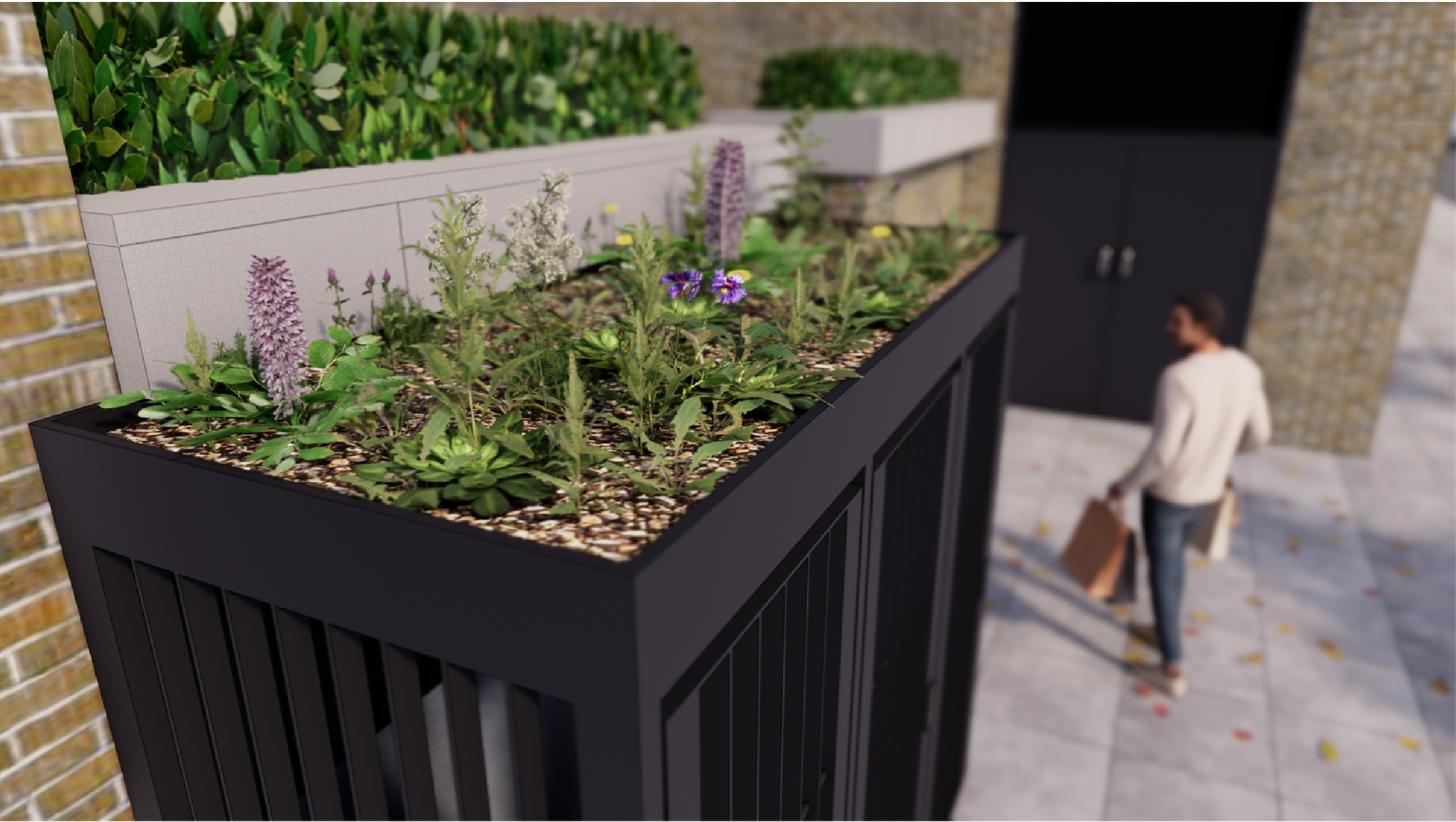
CGI Perspective view from Churchway toward junction with Grafton Place Field of view 25mm

This drawing and the copyrights and patents therein are the property of JPM Drafting and may not be used or reproduced without consent. This drawing is to be read in conjunction with all relevant consultants and/or specialist's drawings/documents and any discrepancies or variations are to be notified to JPM Drafting before the affected work commences.