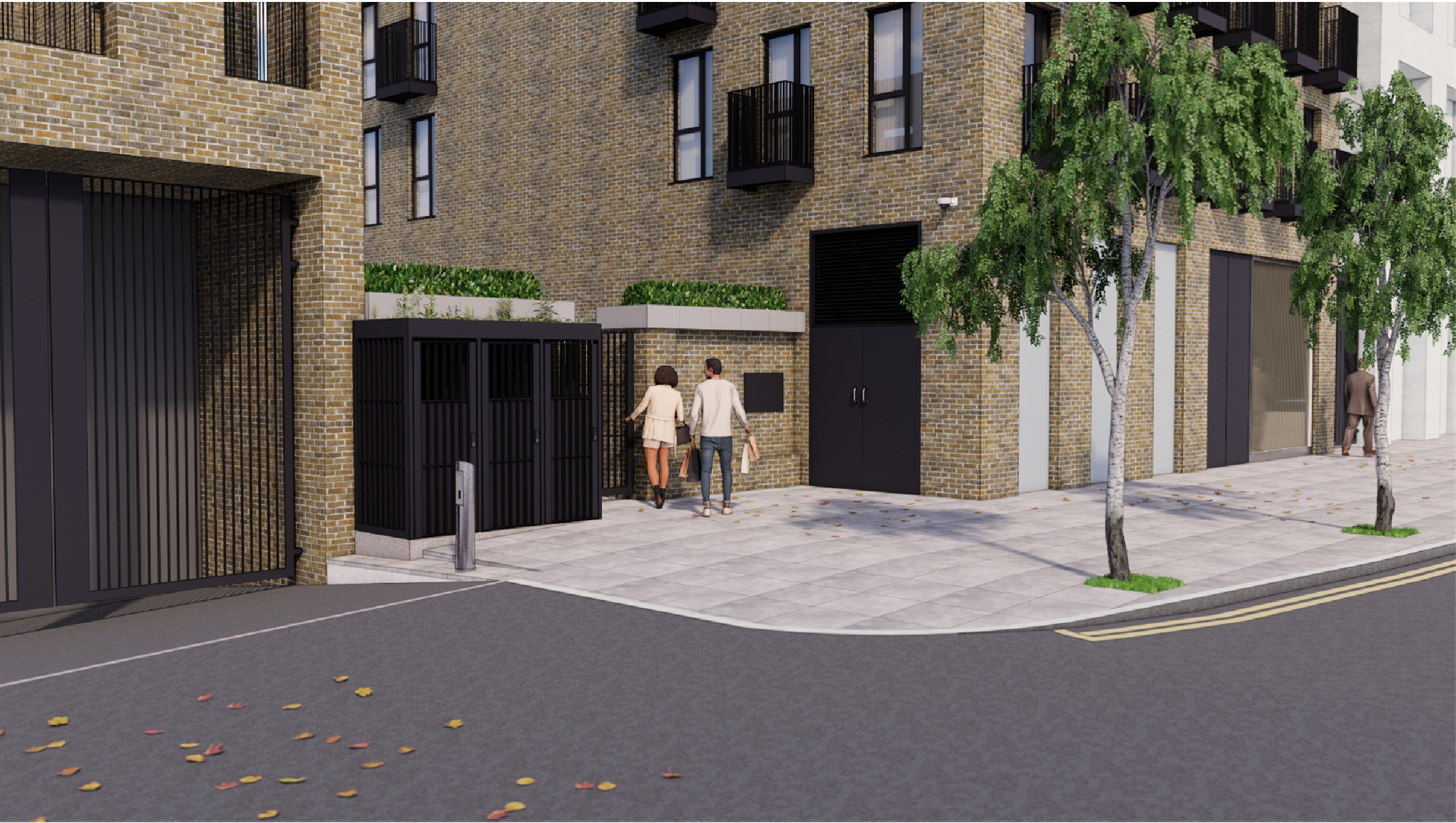
CGI Perspective view from Churchway toward junction with Grafton Place Field of view 25mm

This drawing and the copyrights and patents therein are the property of JPM Drafting and may not be used or reproduced without consent. This drawing is to be read in conjunction with all relevant consultants and/or specialist's drawings/documents and any discrepancies or variations are to be notified to JPM Drafting before the affected work commences.