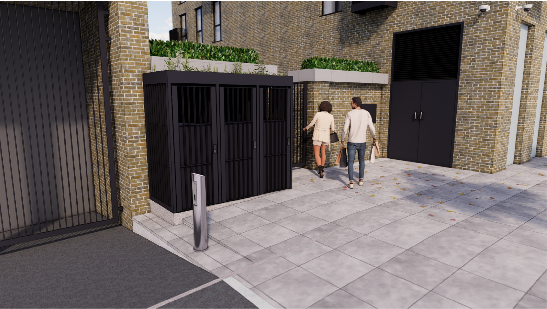
CGI Perspective view from Churchway toward junction with Grafton Place Field of view 25mm