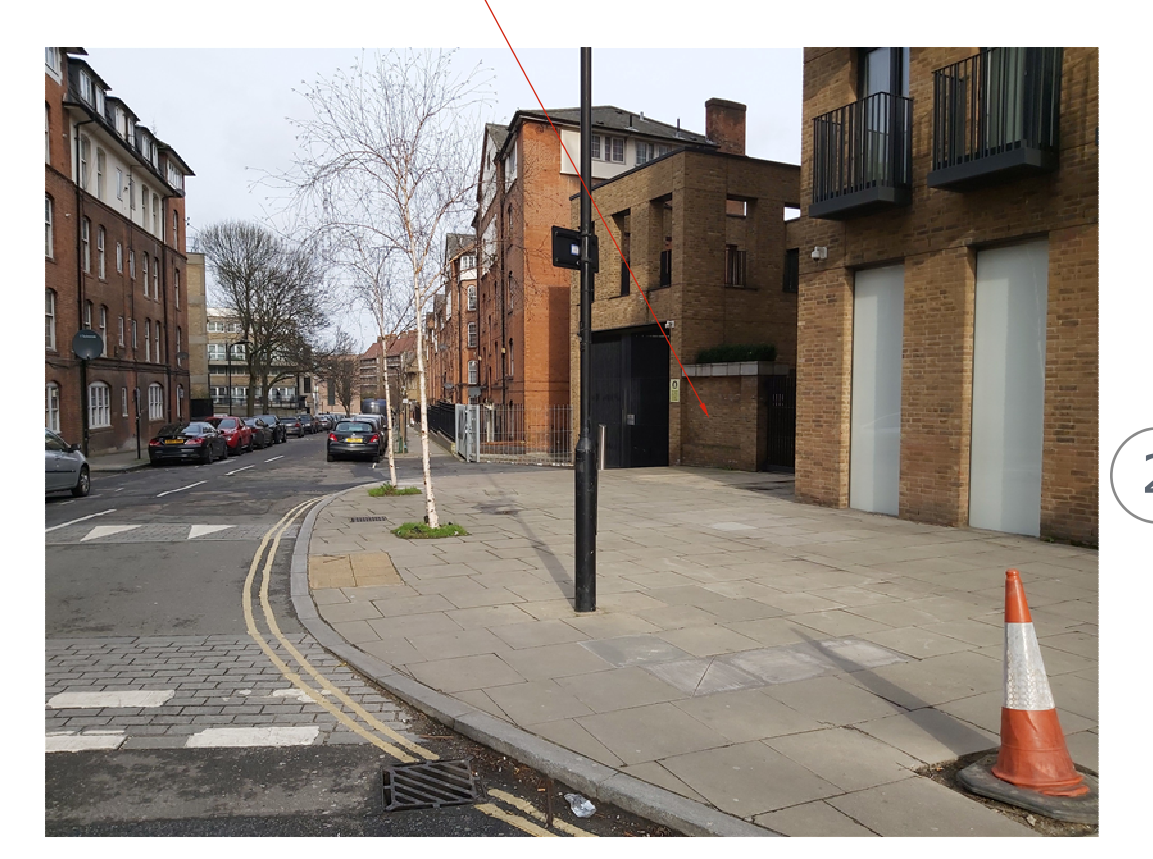
Approach from South to North along Church Way toward site.