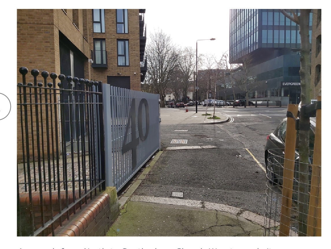
Approach from North to South along Church Way toward site.

Photographs showing proposed Bin Store location as approached on foot. Photographs focal length 25mm