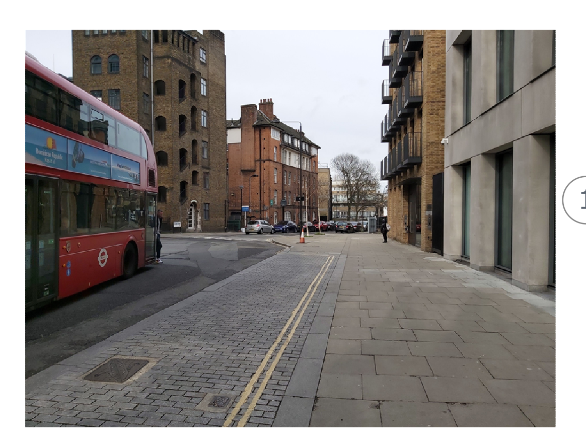
Approach from South to North along Church Way toward site.

This drawing and the copyrights and patents therein are the property of JPM Drafting and may not be used or reproduced without consent.