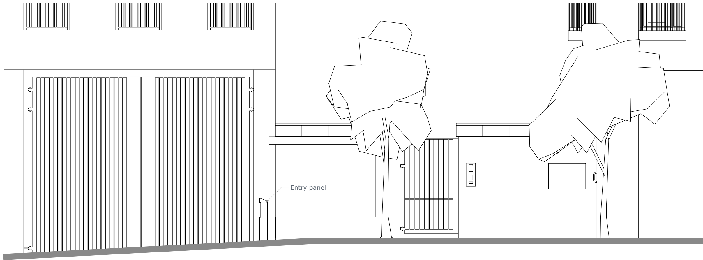
Front Elevation as Exisitng Scale 1:50

This drawing and the copyrights and patents therein are the property of JPM Drafting and may not be used or reproduced without consent.