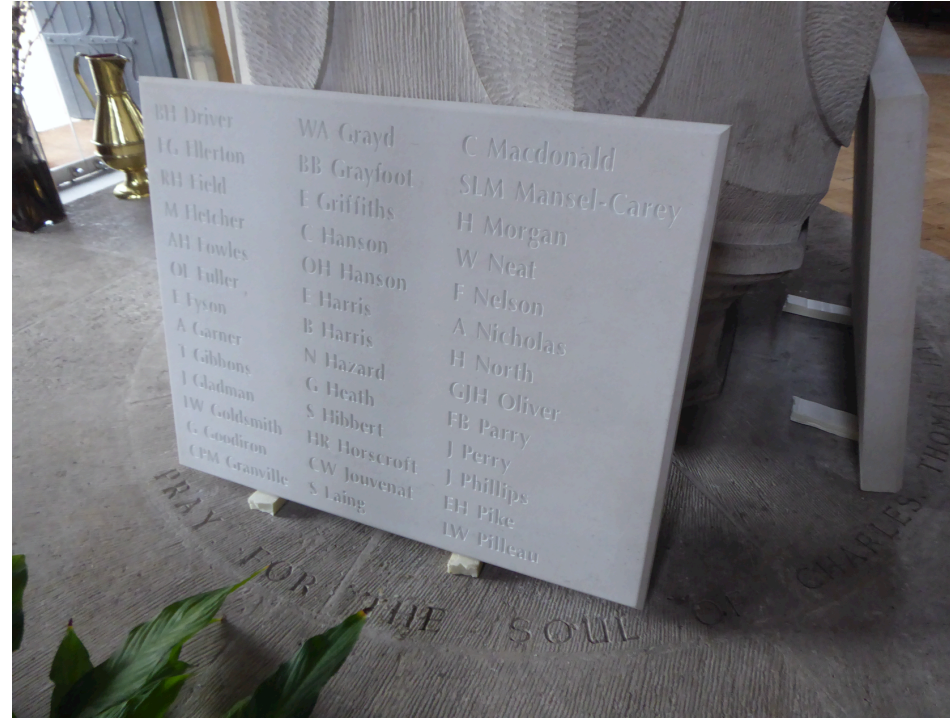
Photograph of one of the proposed tablets