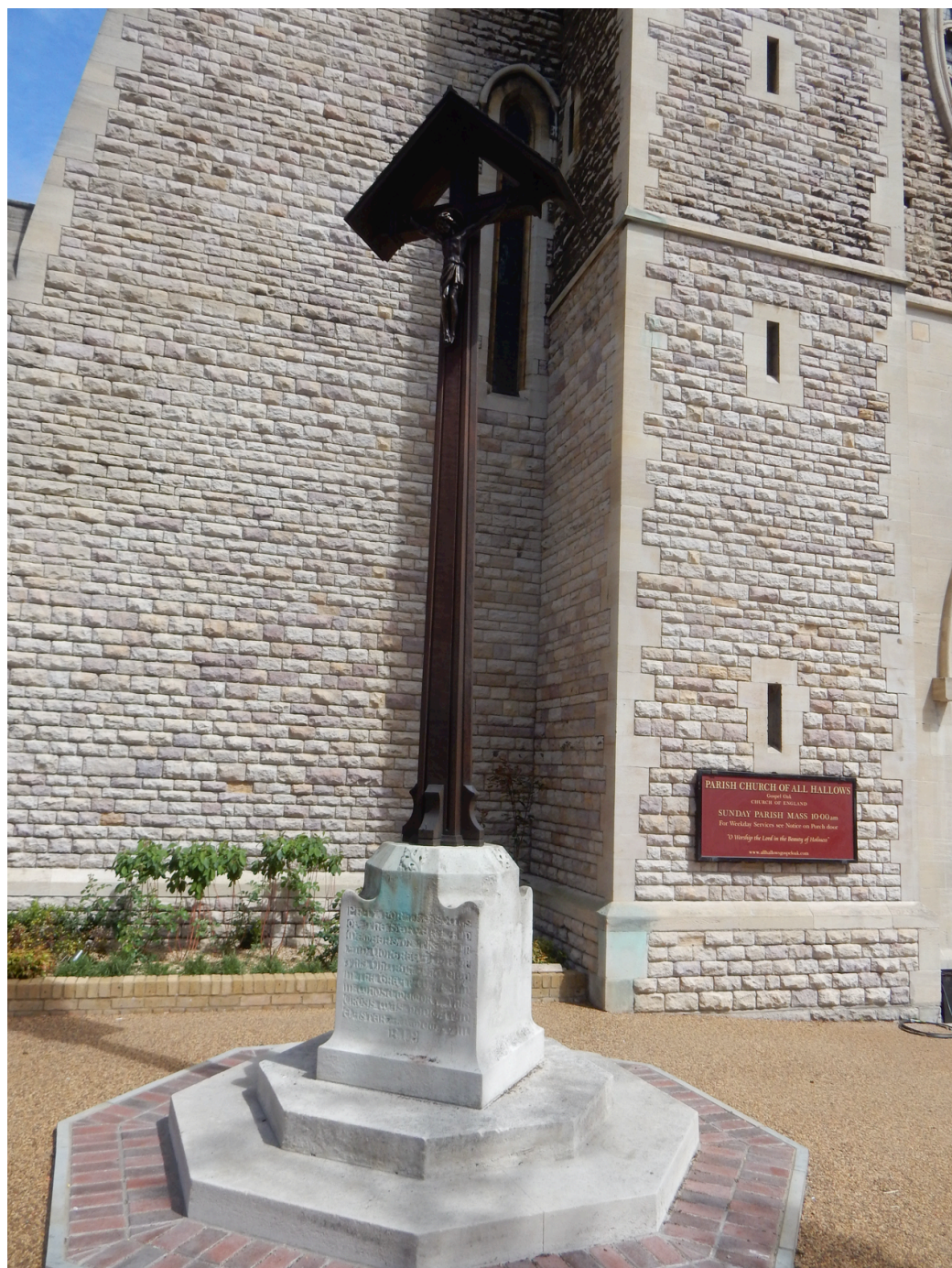
A 10/10/20 Scale Bar

Revisions Do not scale from drawings for construction. Report all discrepancies to HMDW Architects and seek clarification before proceeding.