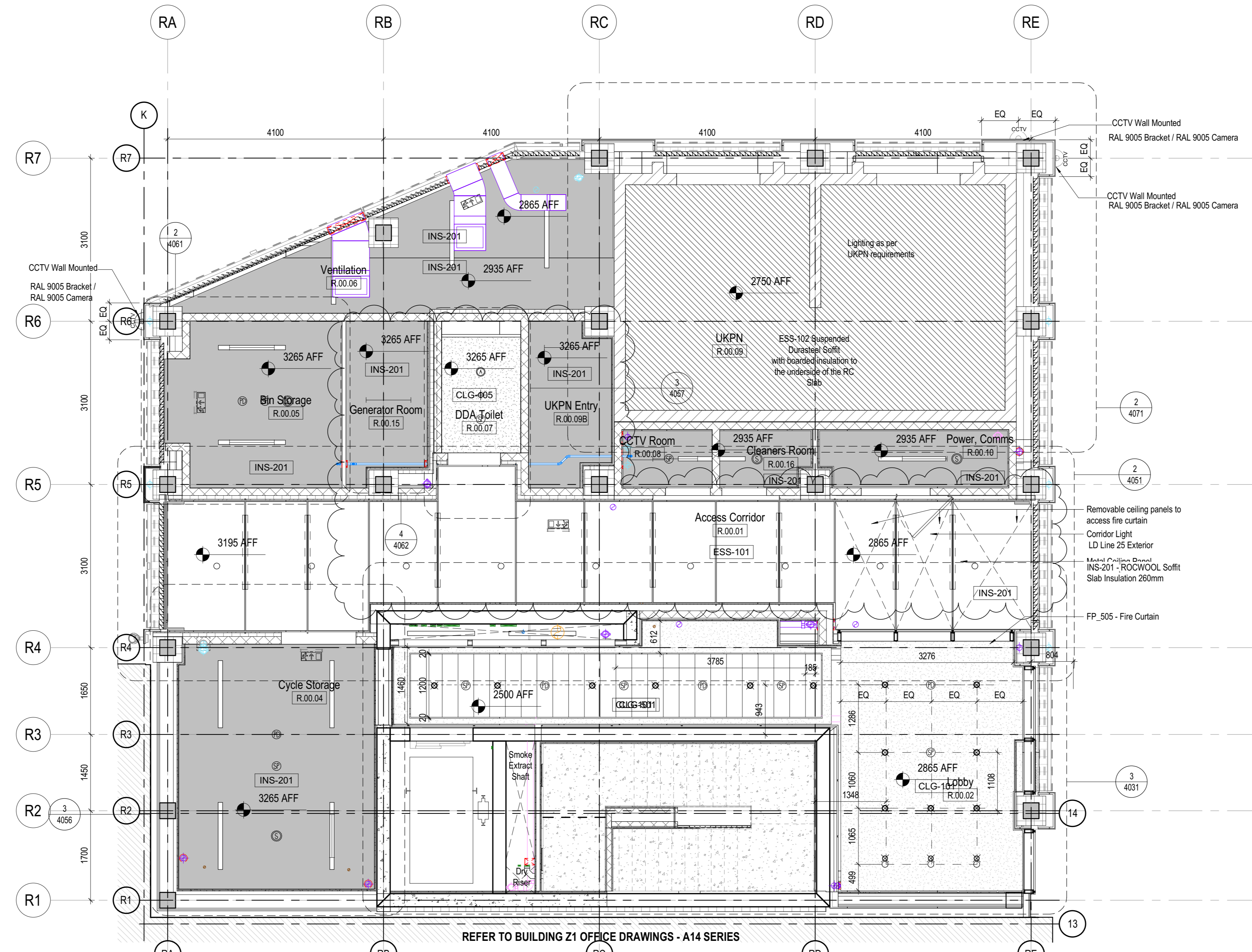
2 RCP RESI GROUND FLOOR 1:50 REFER TO THE RELEVANT A40-ENLARGED PLANS DRAWINGS AND A58 SERIES FOR RCP DETAILS Those drawings are for setting out purposes only, refer to MEP contractual documents for specs and services layouts.