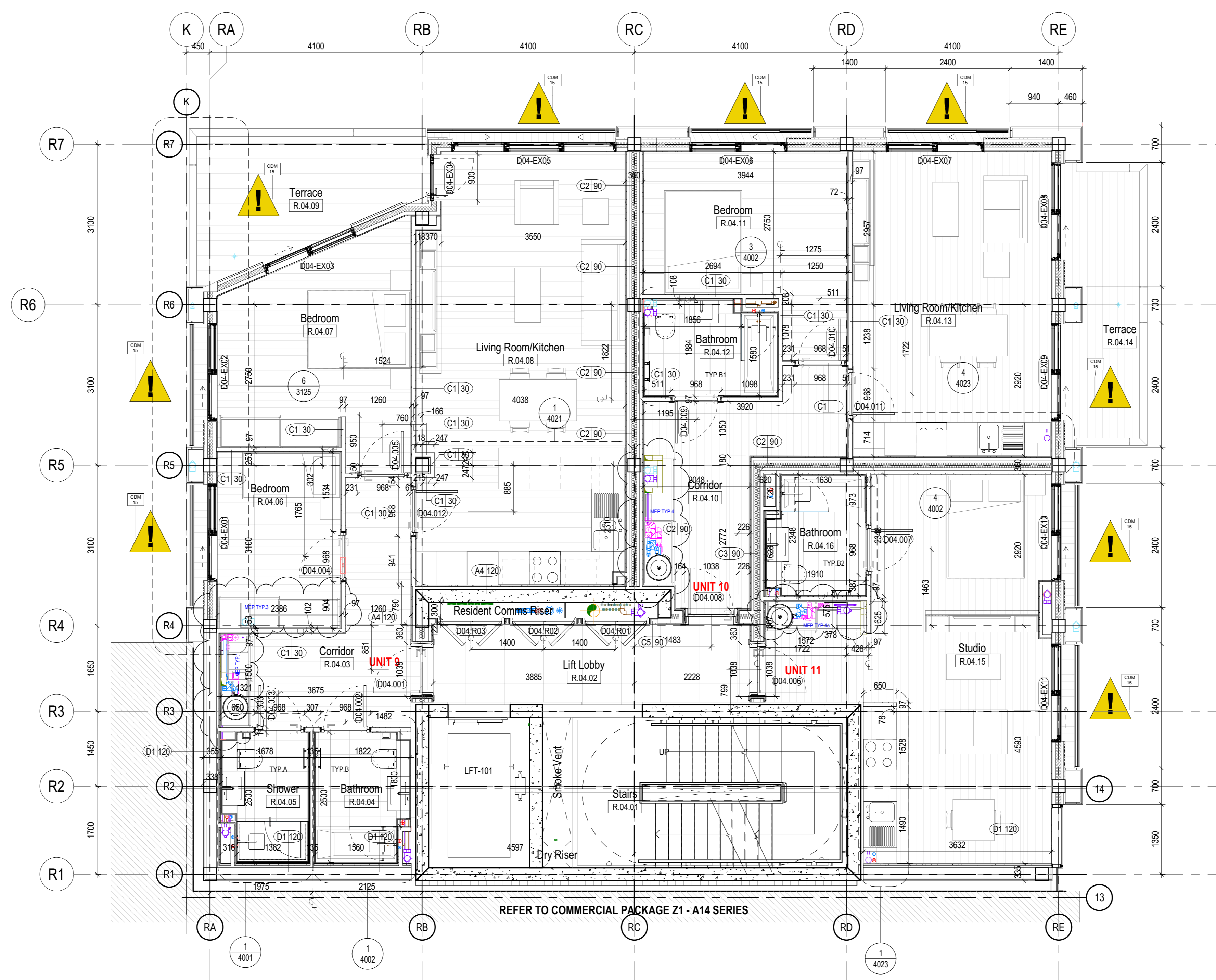
2 Consolidated Dimensions Plan Level 04 1 : 50 Bathroom Layouts noted on this plan should be viewed along with A40 Series Enlarged Plans - Bathrooms