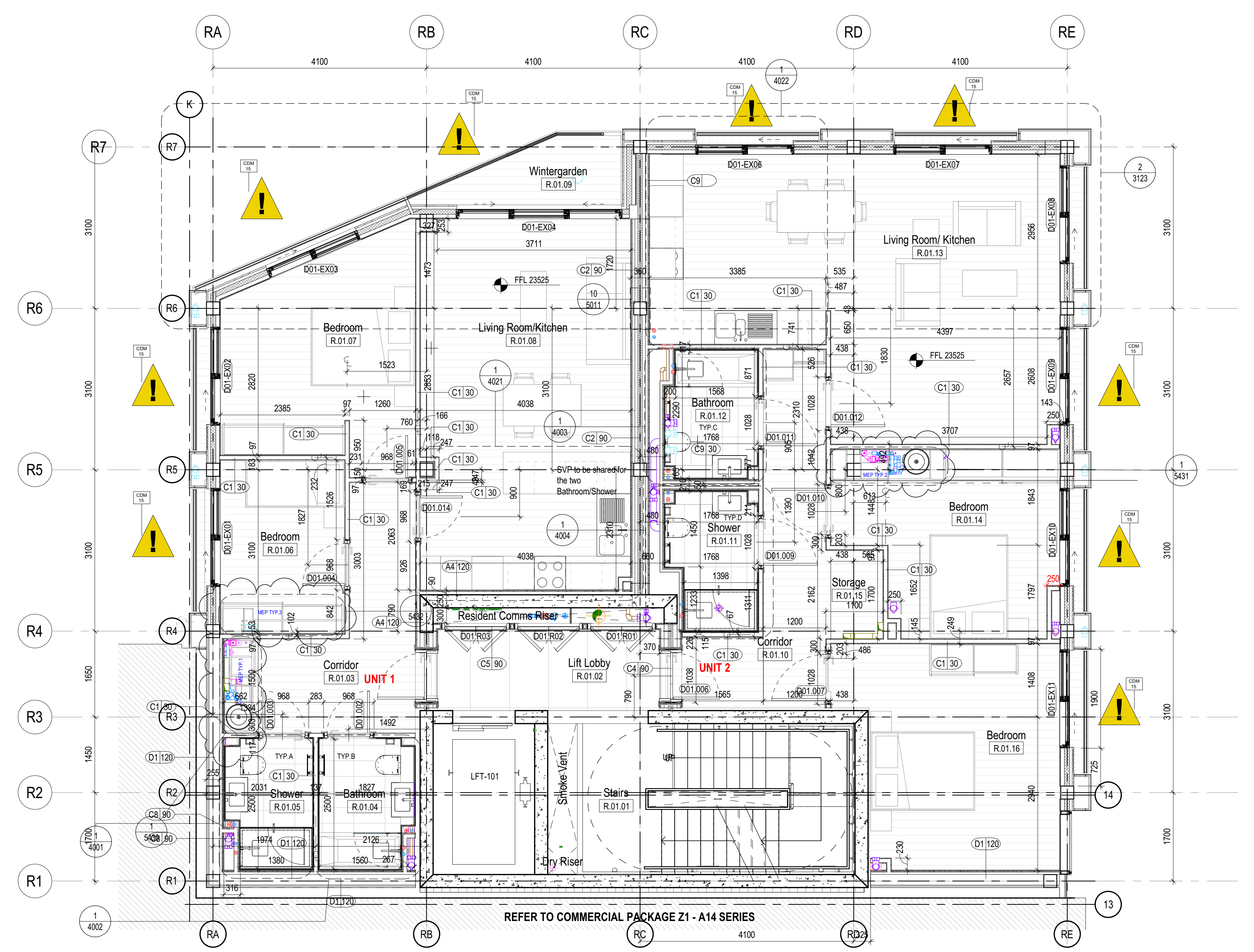
1 Consolidated Dimensions Plan Level 01 1 : 50 Bathroom Layouts noted on this plan should be viewed along with A40 Series Enlarged Plans - Bathrooms