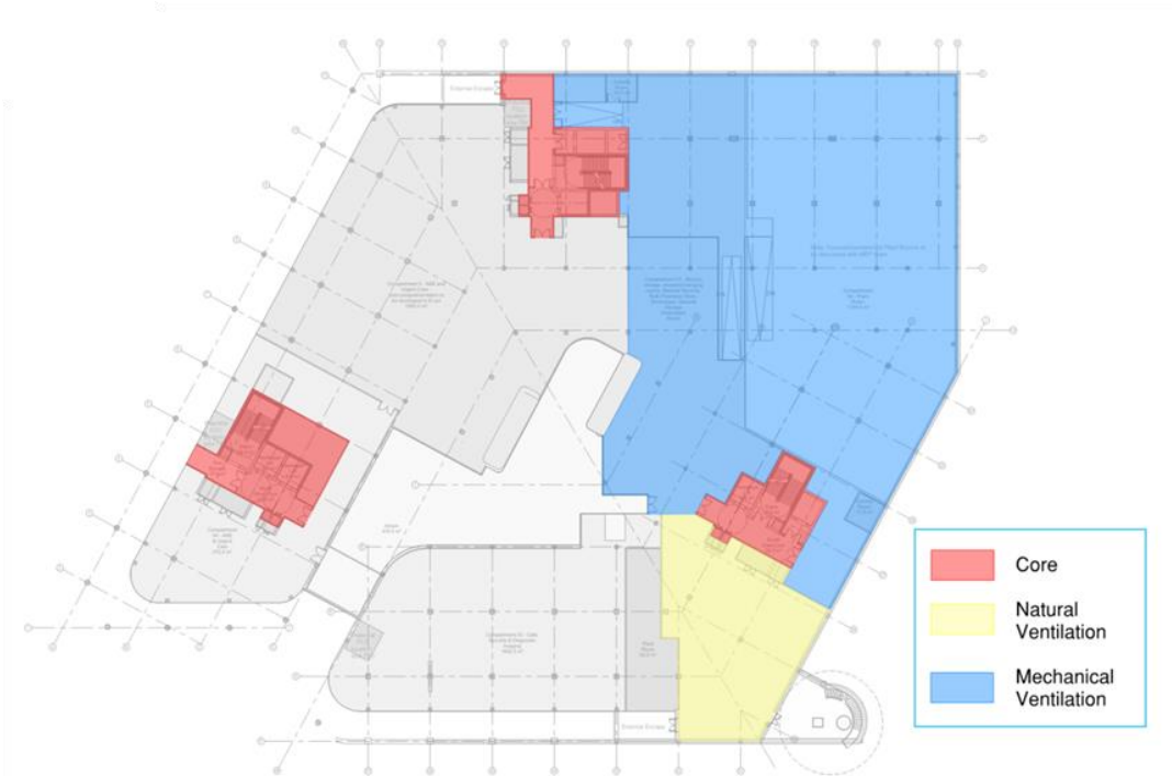
Figure 7-1: Configuration of lower ground floor ventilation