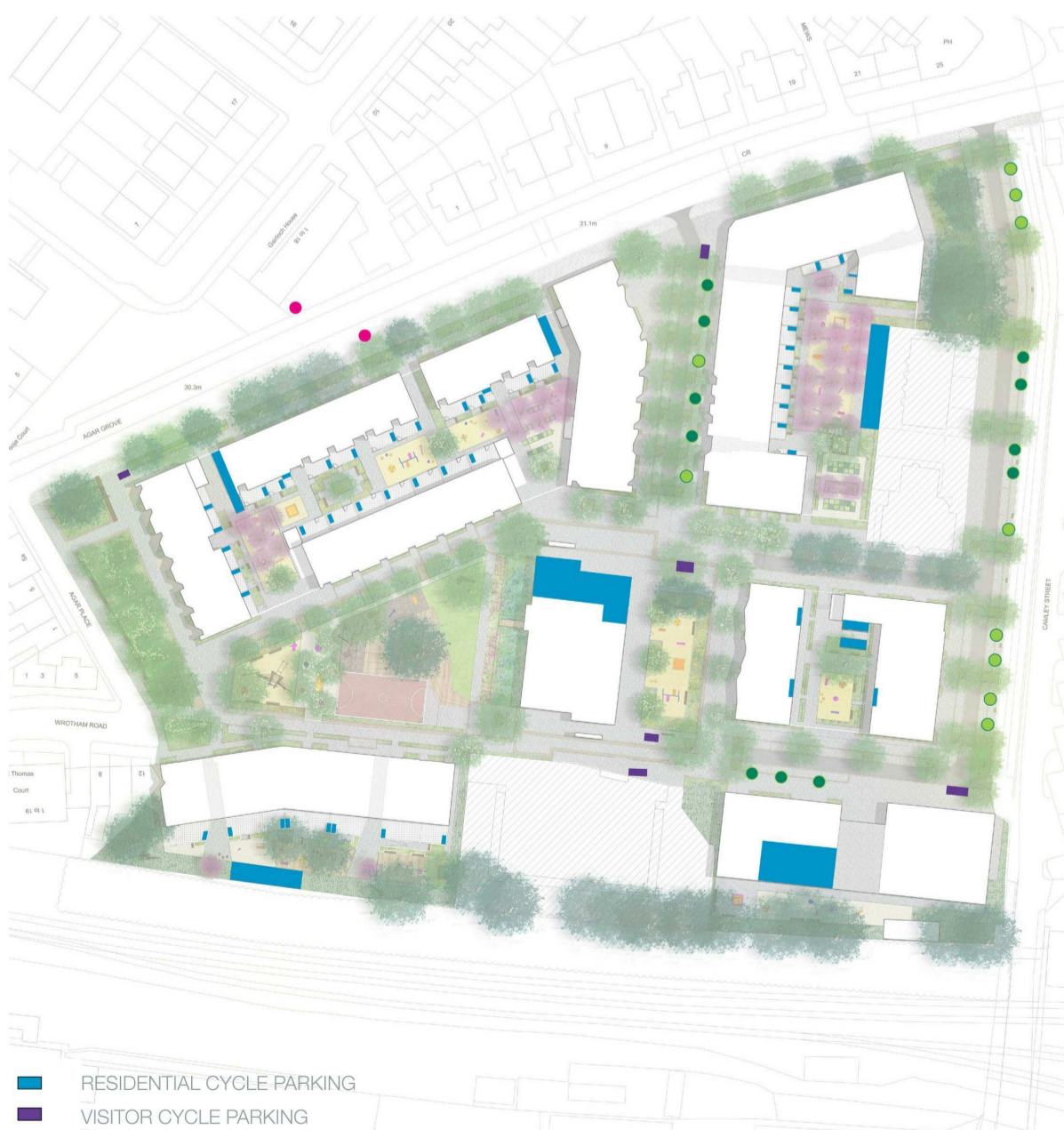
Cycle Parking Provision

The cycle parking is presented in the Cycle parking Strategy diagram.