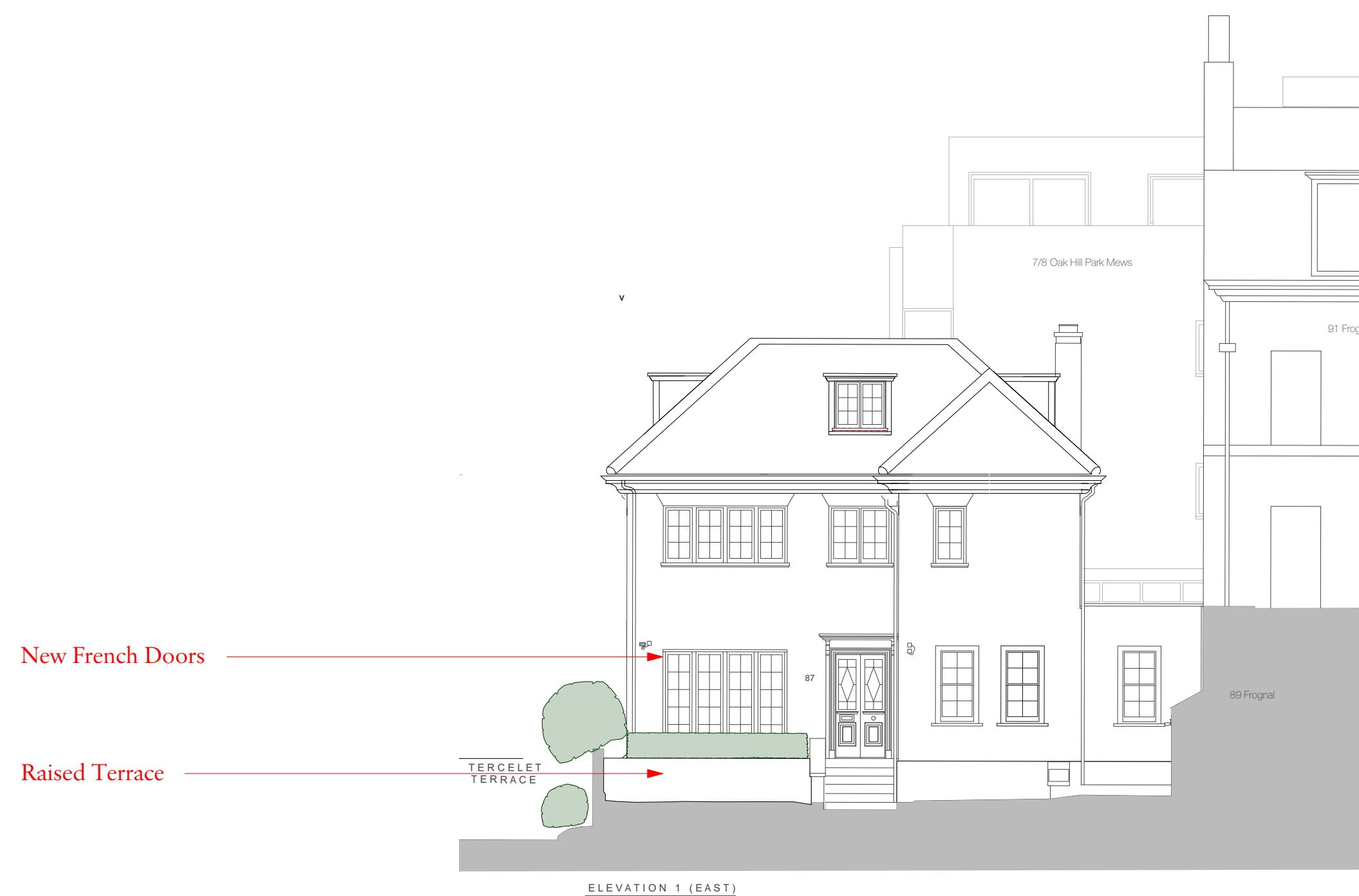
Proposed East Elevation 1:100