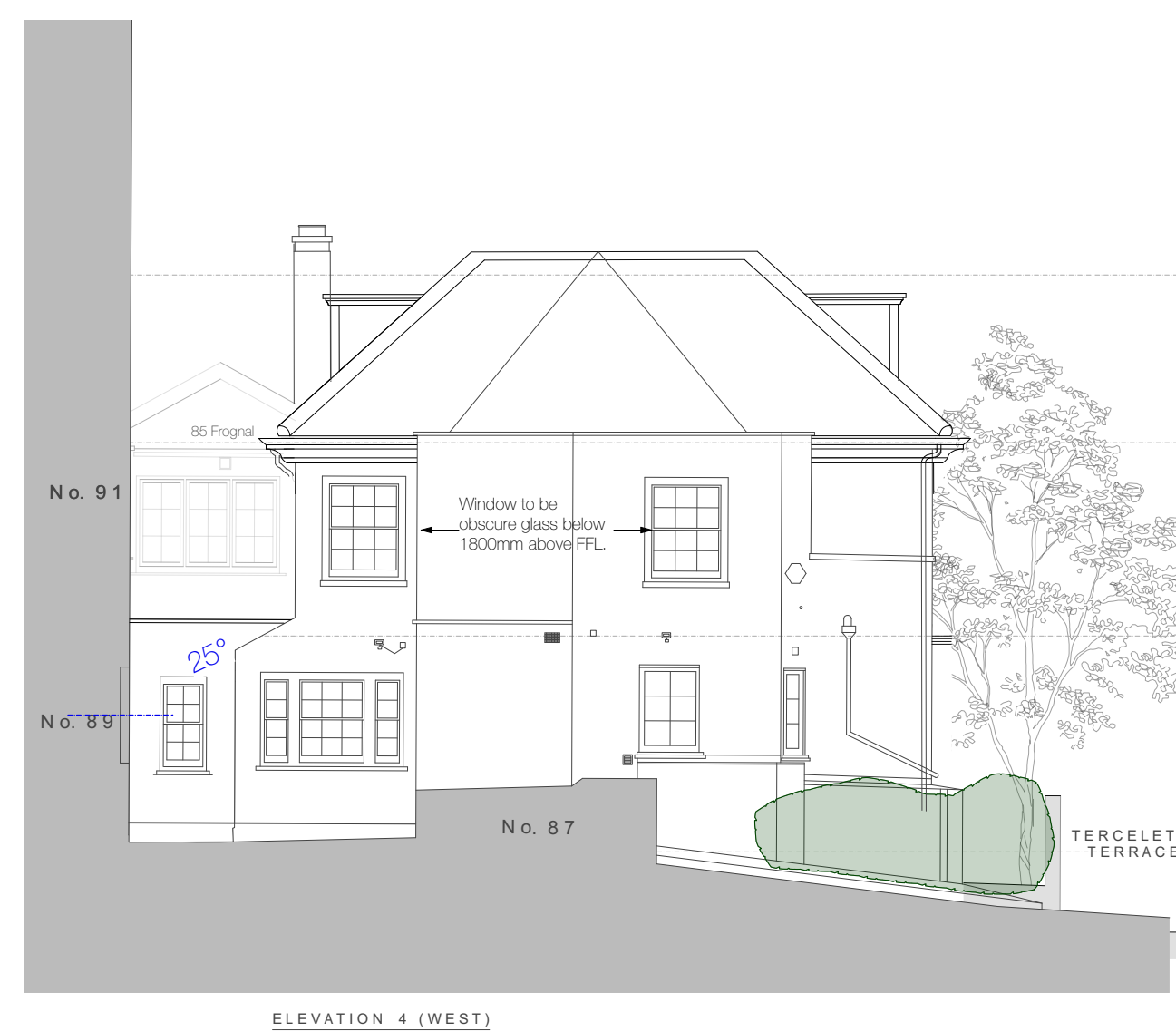
Consented West Elevation 1:100