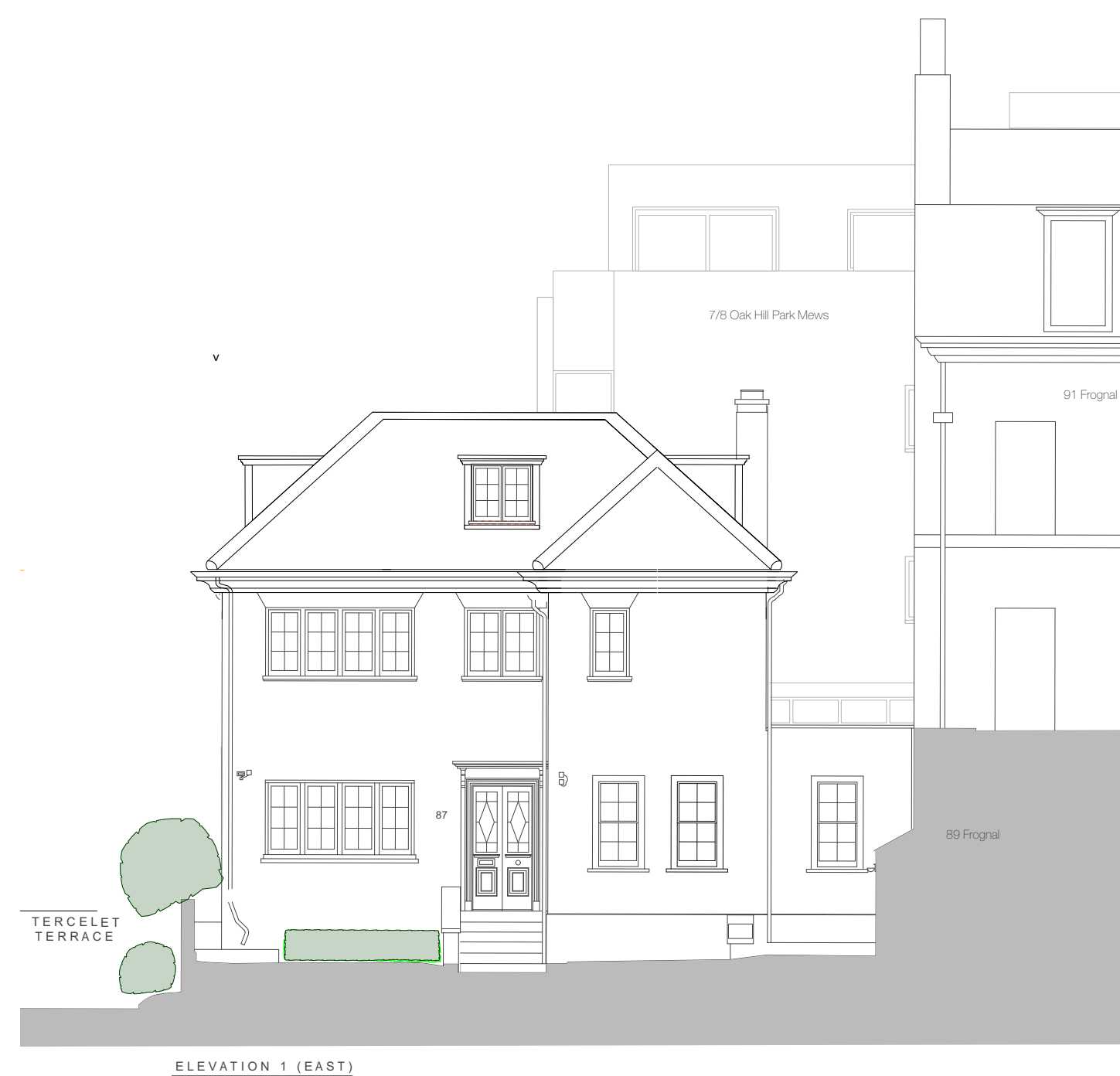
Consented East Elevation 1:100

West Elevation - New Kitchen door instead of central window, skylight added to fix drawing error on consented.