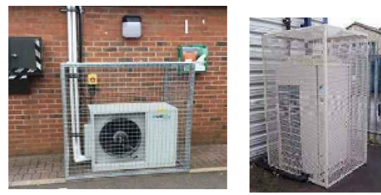
TYPICAL PLANT COMPOUND

500x500 EXHAUST LOUVRE SERVING STAFF FACILITIES HEAT RECOVERY UNIT. LOUVRE c/w 50% FREE AREA WITH ANTICIPATED VELOCITY OF 2.5m/s MAXIMUM. REFER TO ELEVATION B, DRAWING No. M50-EX02.