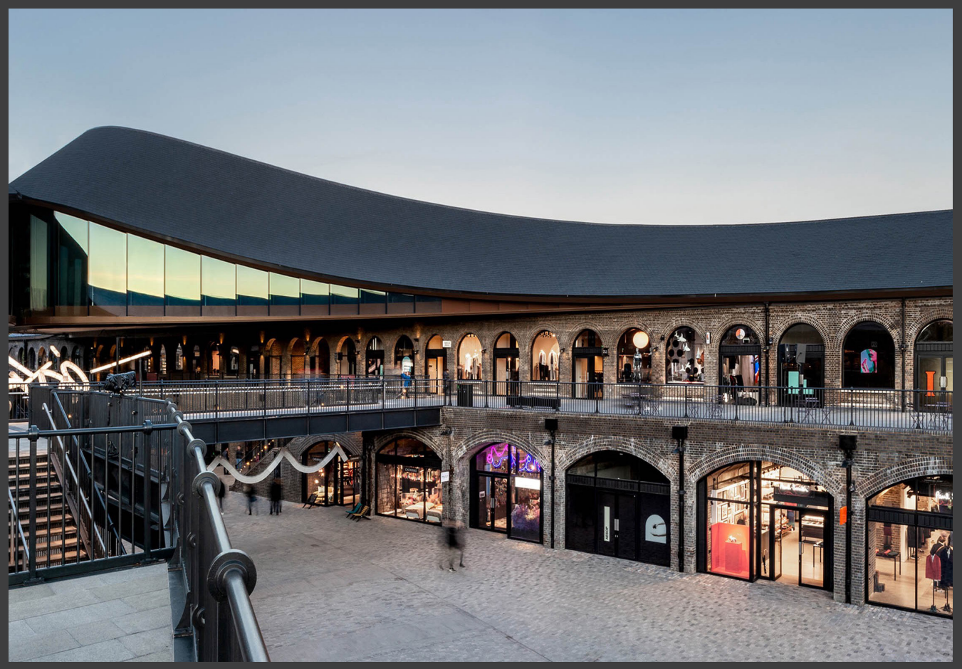
Giles Quarme Architects