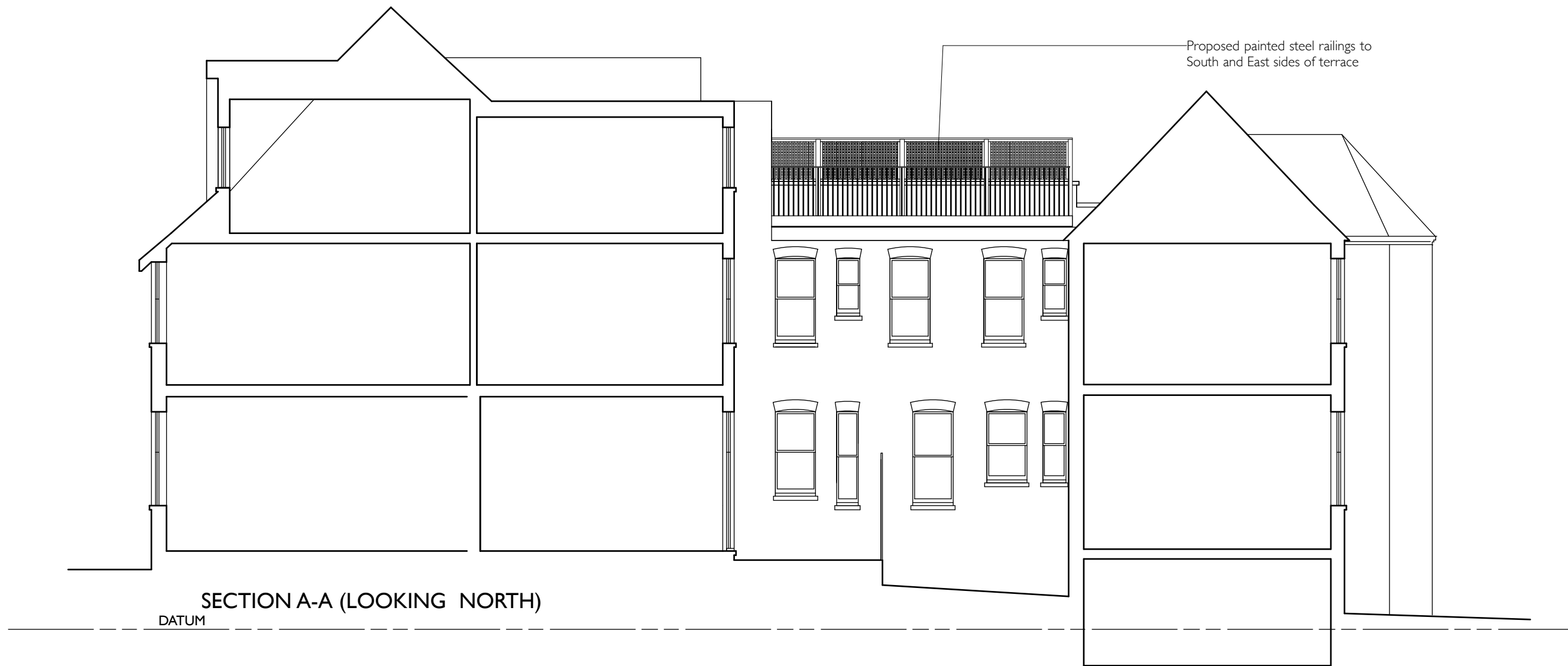
SECTION A-A (LOOKING NORTH)