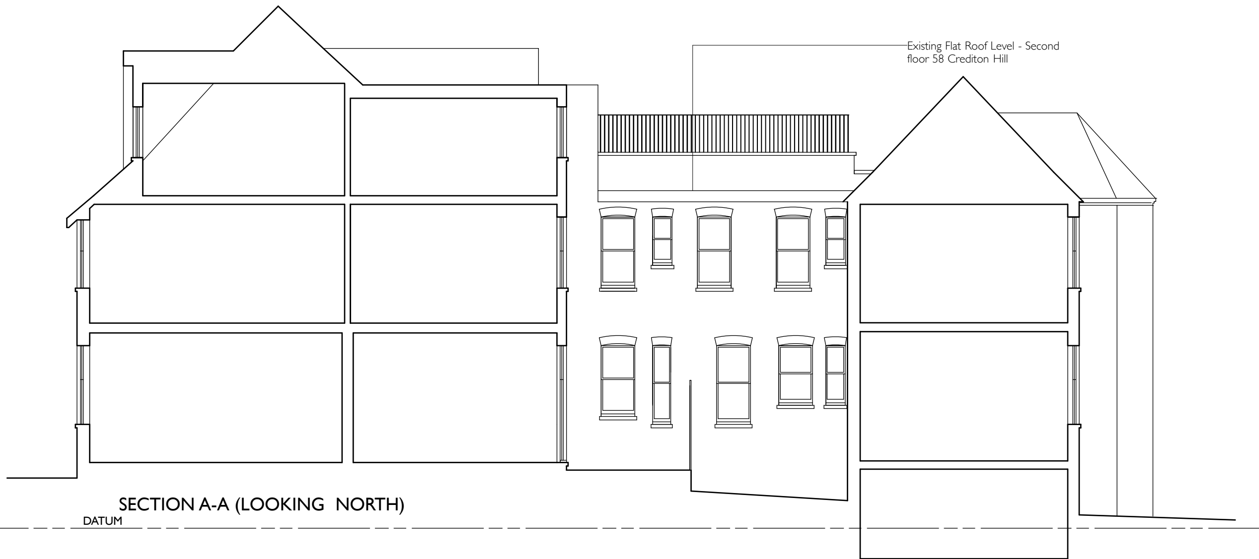
SECTION A-A (LOOKING NORTH)