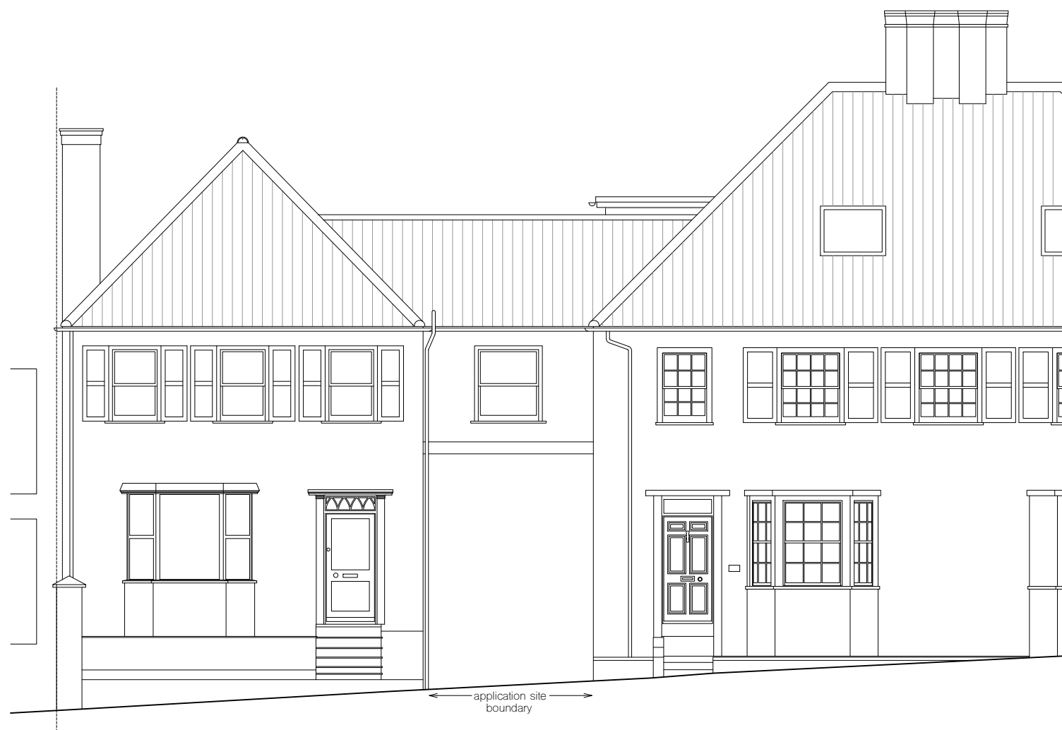
1 proposed elevation 1:50@A1