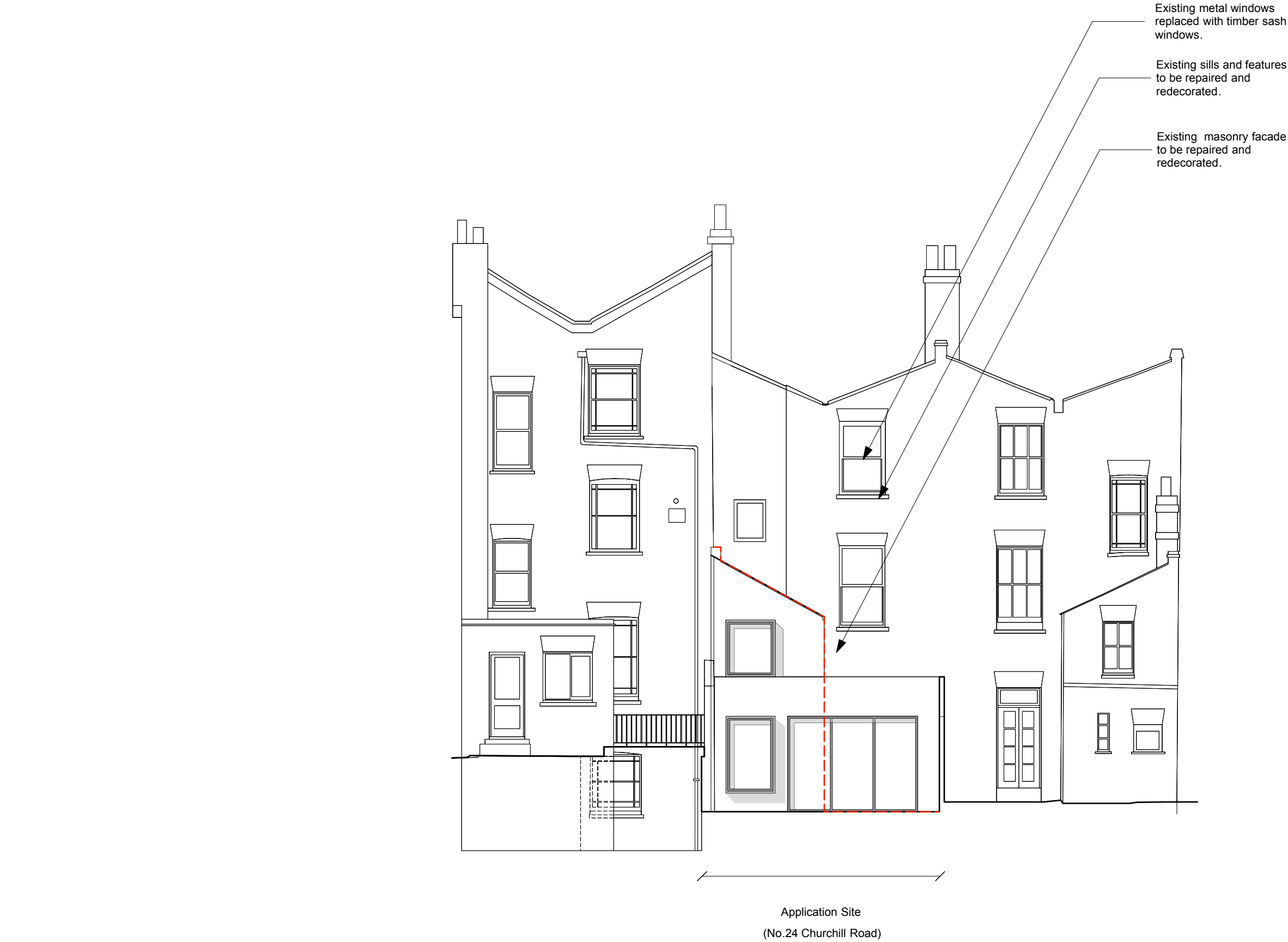
01: Proposed Rear Elevation