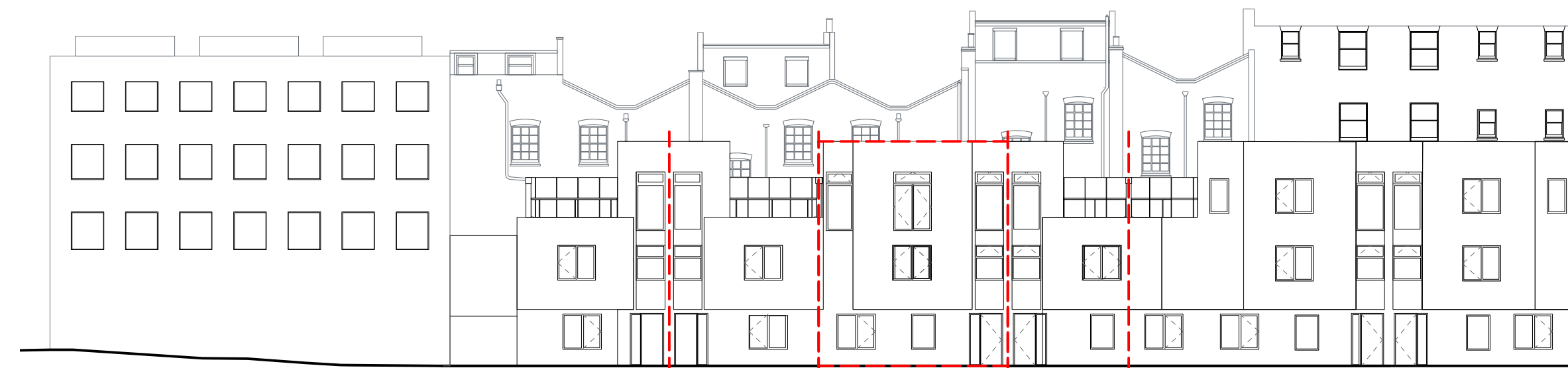
3 Proposed North Elevation (Street Elevation) Scale: 1:200