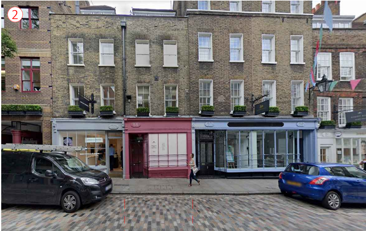
Similar Projecting Sign on adjacent property