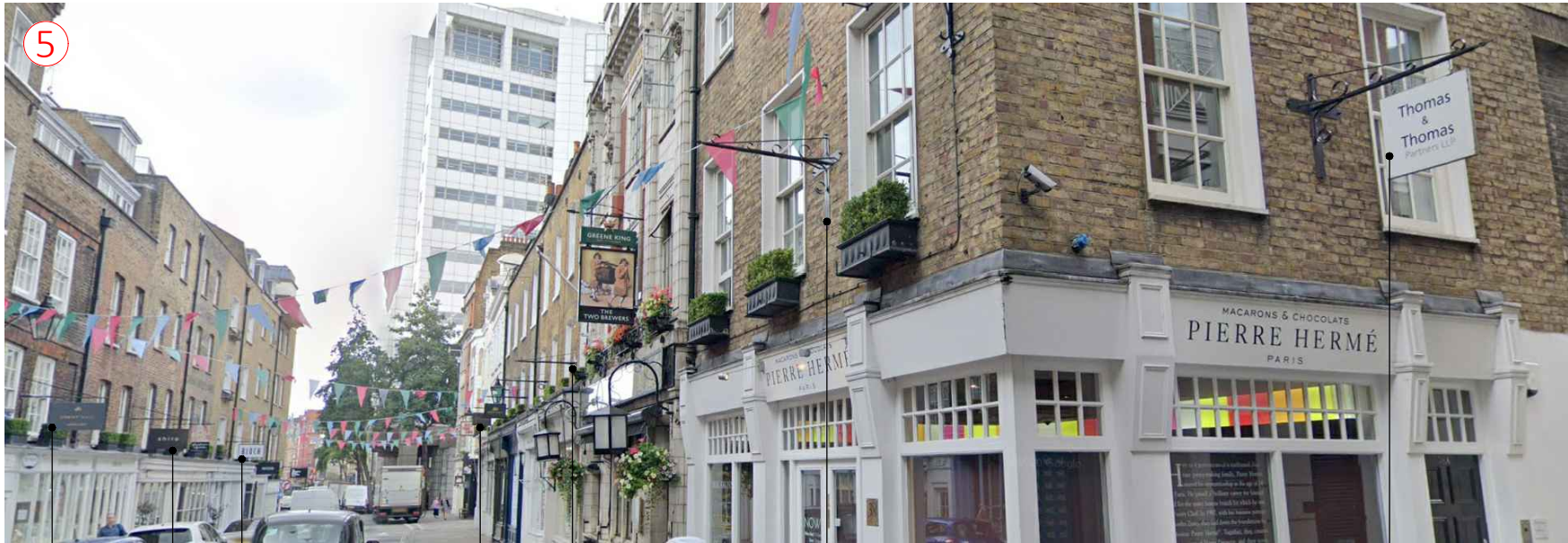
Similar Projecting Sign on adjacent property

Similar Projecting Signs on neighboring properties