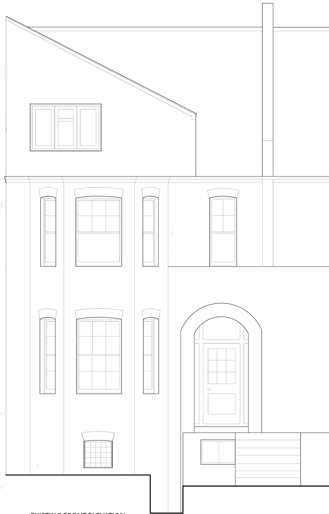
EXISTING FRONT ELEVATION 5 & 6 BRAMSHILL MANSIONS 85 DARTMOUTH PARK HILL LONDON NW5 1JG