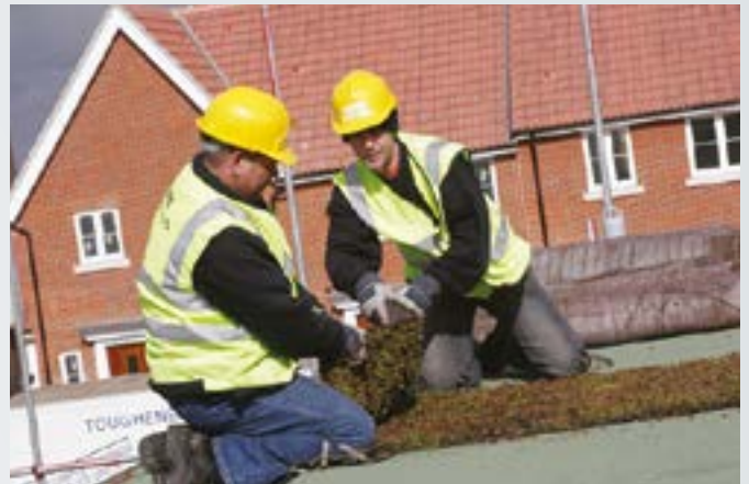
Short 2m rolls of XF301 Sedum System installed by hand.