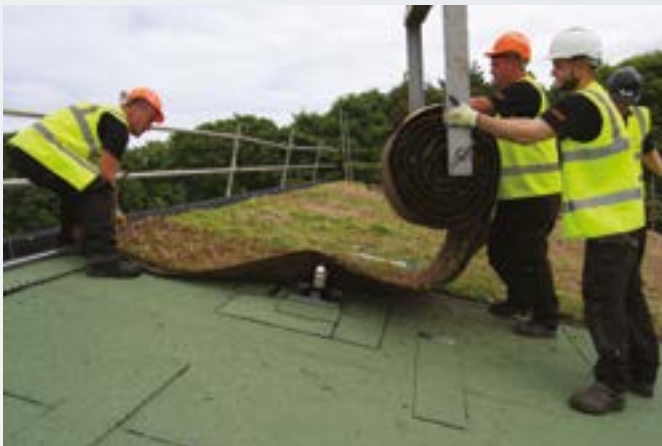
Long length rolls are used to speed up installation process.