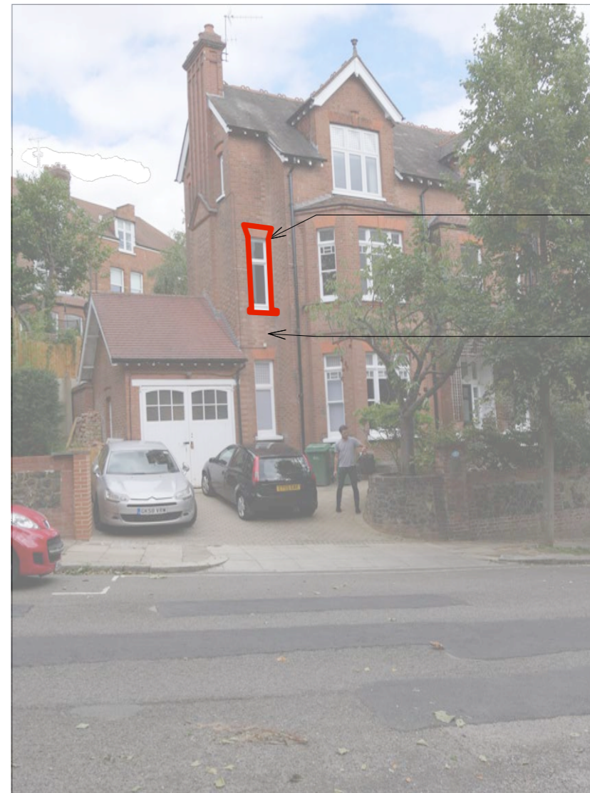
Reference window and brickwork image Not to scale

Windows to proposed extension to be timber casement windows to match indicated window on host building, with brick arch, cill, frame and sash profiles to match.