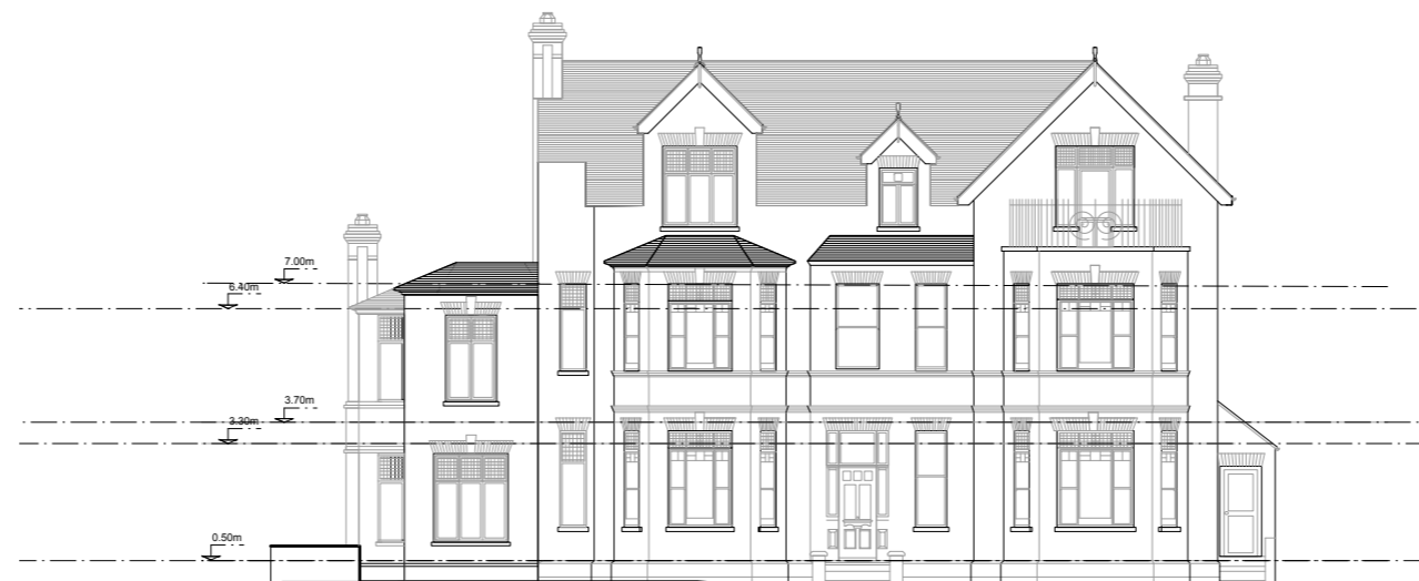
Revised proposal: Street elevation 1:200 @ A3