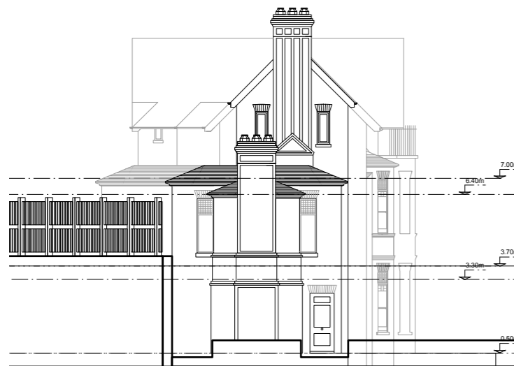
Revised proposal: North West elevation 1:200 @ A3