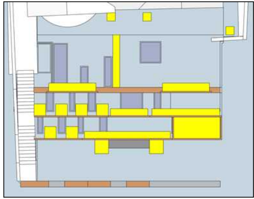
Plan view (nts) showing planting areas shaded in yellow