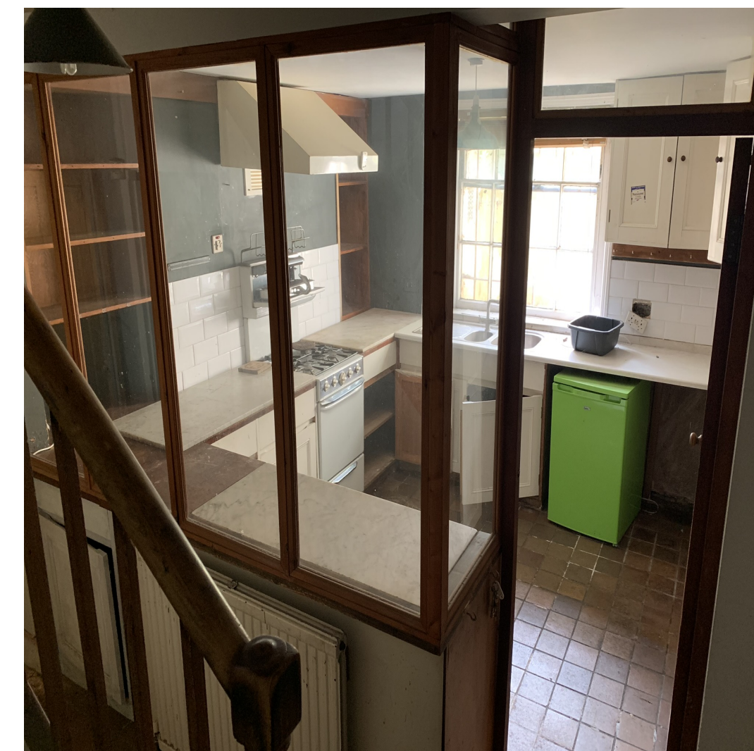
kitchen photographed prior to unauthorized removals 2019