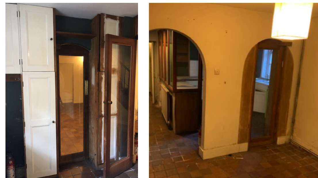
kitchen infill photographed prior to unauthorized removals 2019