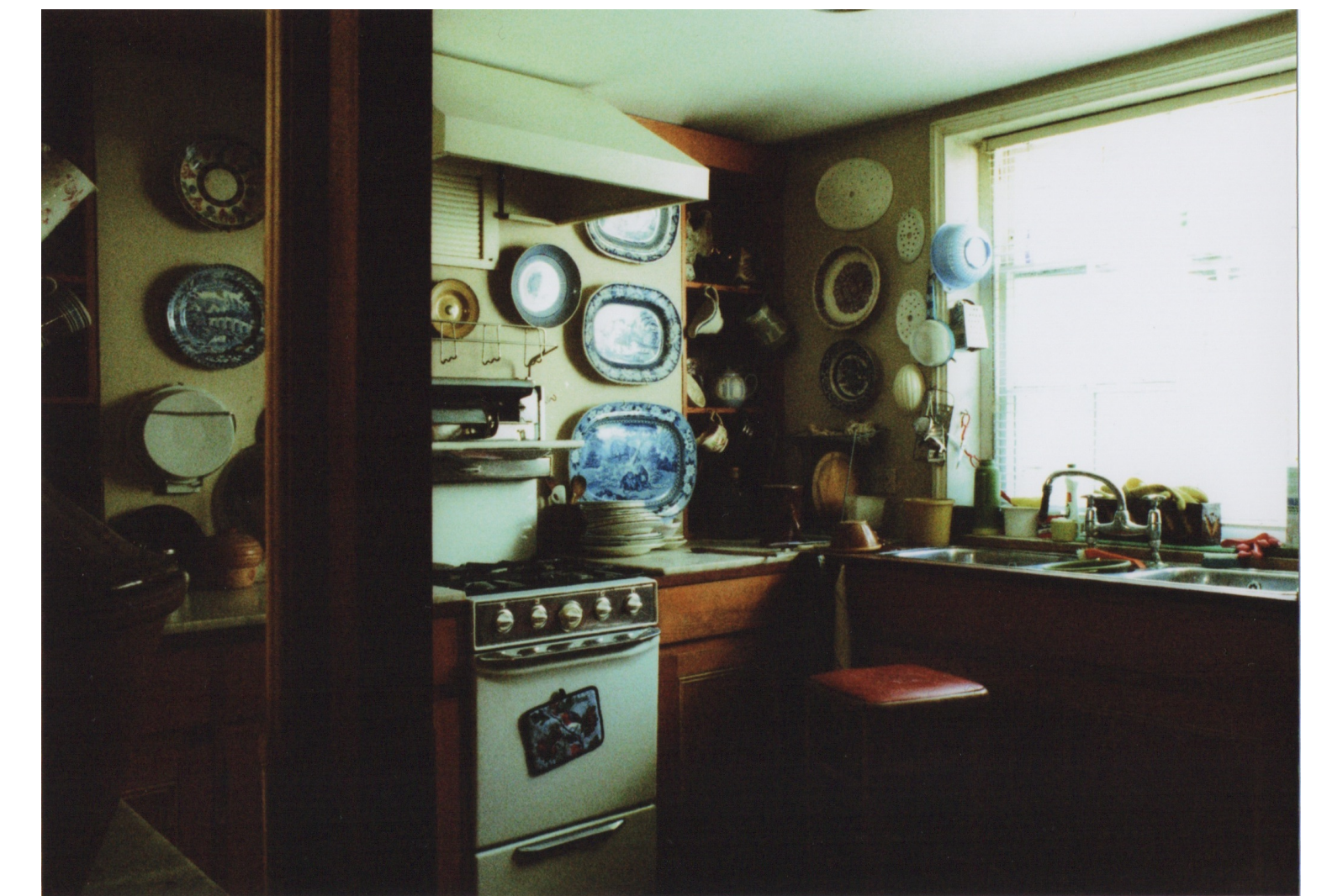
kitchen photographed during Alan Bennett's residency est. 1990's