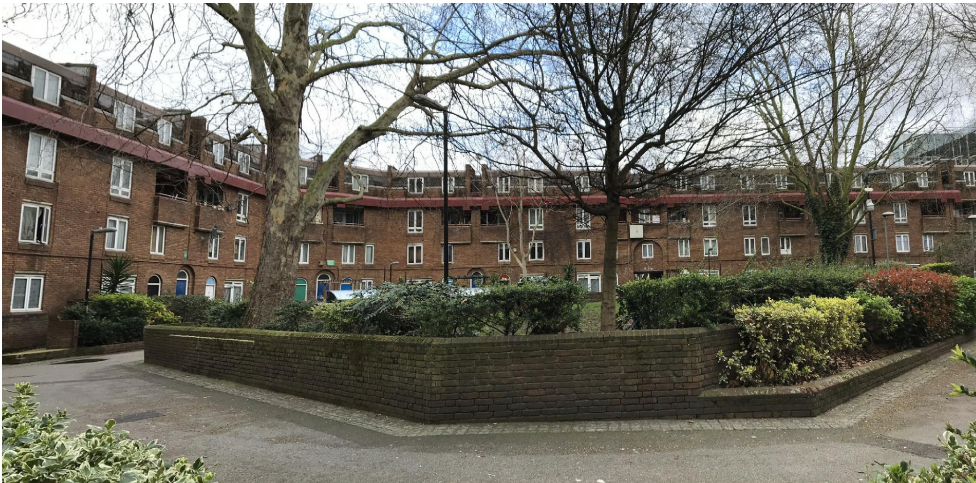
4. Wall and low planter surrounding the lawn (mature Plane tree on the left)