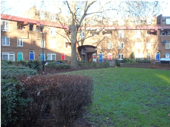
3. View across the lawn towards the Plane tree