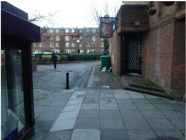
7. Access to the square from Hampstead Road