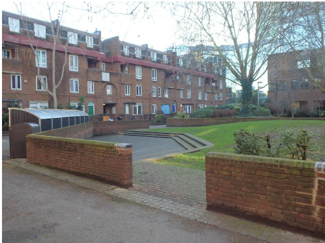
2. View towards the bins and across the lawn