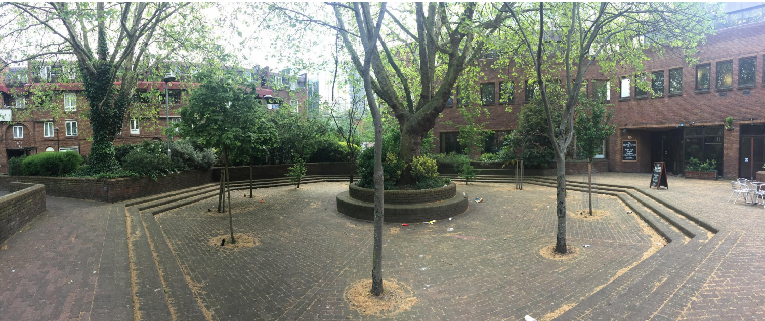
View 1. Panorama of the paved sunken area