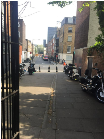
8. Access from North Gower St.