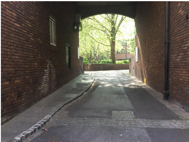
6. Access to the square from Drummond Street