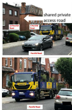
Figure 1.4 - Instance of large vehicle determining how to reverse into shared private road