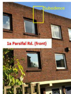
Figure 1.1 - Front of 1a Parsifal Road