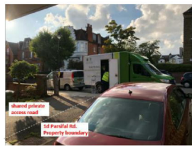
Figure 1.6 – Delivery vehicle blocking access

The addition of further properties proposed in this planning application will increase congestion and is contrary to the Camden Local Plan 2017 (pg. 186, section 6.9) which states "...developments dependent upon large goods vehicle deliveries will also be resisted in predominantly residential areas.." and it also conflicts with the Camden Local Plan 2017, Policy A1 (pg 184, sections c). "The Council will seek to protect the quality of life of occupiers and neighbours.." and that "...We will resist development that fails to adequately assess and address transport impacts affecting communities, occupiers, neighbours.."