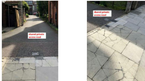
Figure 1.8 - Damage to pavement entrance to shared private road