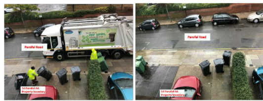
Figure 1.7 – Before & After pictures of weekly Waste collection. Properties 1e, 1f, 1g refuse bins left in-front of 1d after collection

The photos above illustrate daily circumstances. Vehicles at 1d Parsifal Road driveway are illegally blocked by delivery & service vehicles. They also often block the shared private access road at the same time. This planning application will ultimately facilitate a higher frequency of such events which are illegal under the Highways Act Section 137.