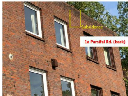
Figure 1.2 - Back of 1a Parsifal Road