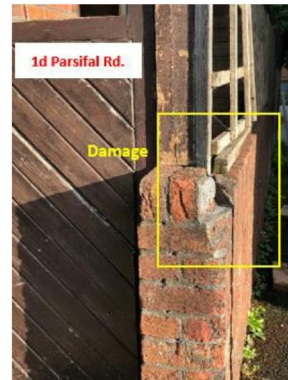
Figure 1.5 - Damage to boundary wall of 1d Parsifal Rd. by previous reversing vehicles

The photos above illustrate this matter. As the private access road is steep and narrow (approx. 3.2 meters wide only) and sharply turns into the adjoining main Parsifal road (a two way road but wide enough for only 1 vehicle to freely drive at a time) large vehicles (typically 3 meters wide) find it difficult to reverse and navigate. They usually drive over the driveway of 1d Parsifal Rd. to reverse into the private access road. It's possible that during or after the proposed development, the boundary wall of 1d Parsifal Rd. may again be damaged by heavy reversing vehicles. Also, there are 2 cars parked on 1d's driveway at times, and other vehicles reversing into the private access road have resulted in impacts.