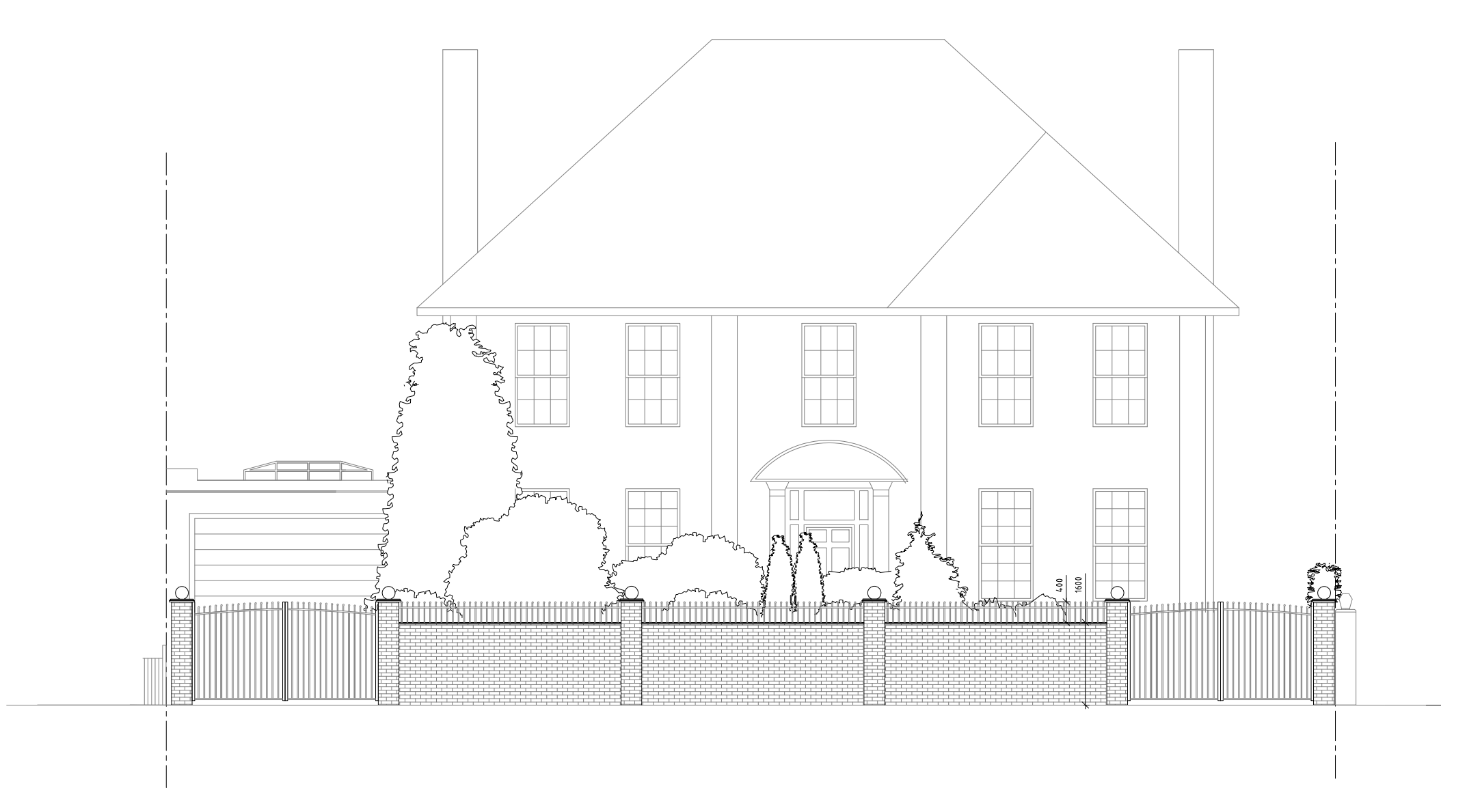
FRONT ELEVATION SHOWING PROPOSED FRONT BOUNDARY WALL SCALE 1:100@A1