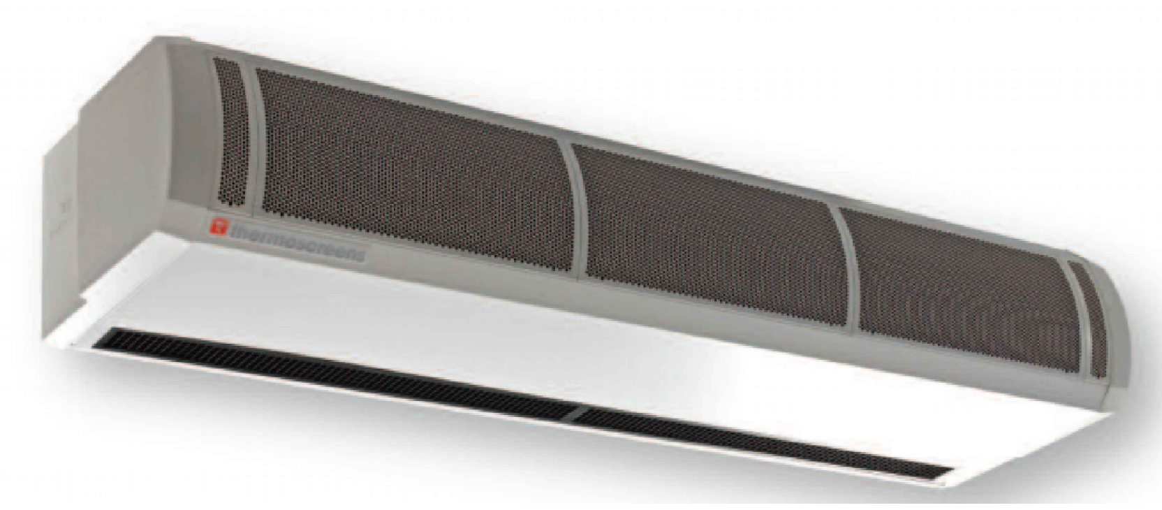
OVER DOOR HEATER