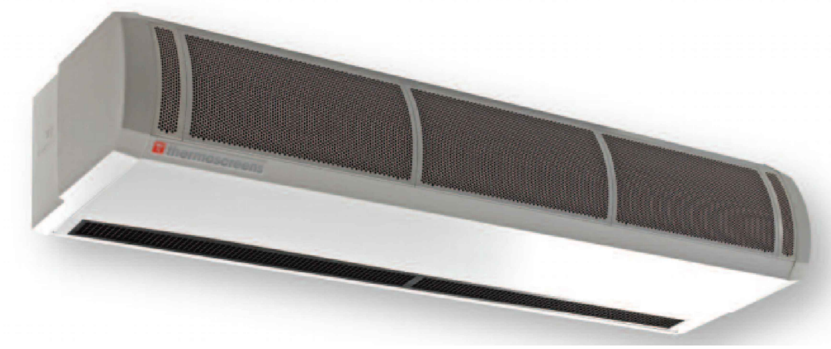
OVER DOOR HEATER