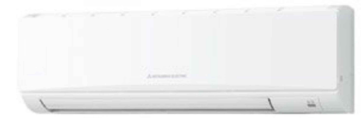
OFFICE AND COMMS ROOM FCU TYPE