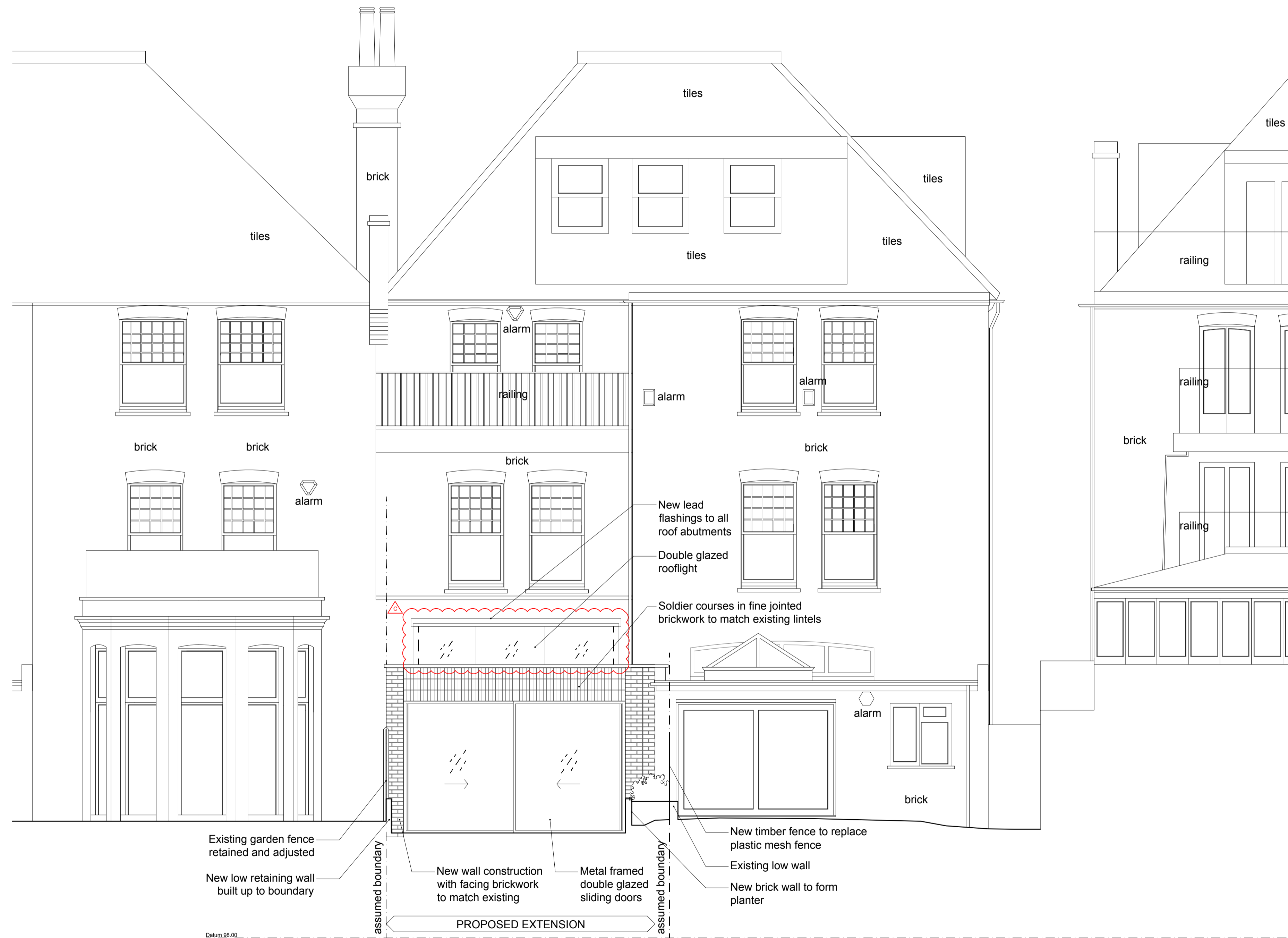
1 PROPOSED REAR ELEVATION