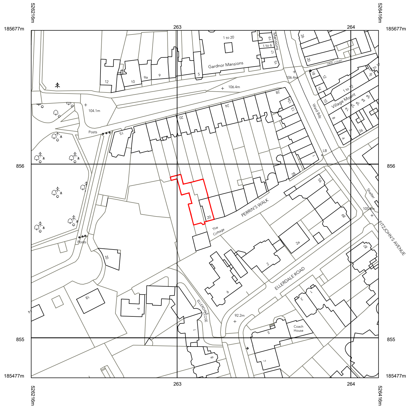
1 LOCATION PLAN scale 1:1250

NOTE DO NOT SCALE FROM THIS DRAWING, EXCEPT FOR TOWN PLANNING PURPOSES. THIS DRAWING IS THE PROPERTY OF TG STUDIO AND COPYRIGHT IS RESERVED BY THEM. THIS DRAWING IS ISSUED ON CONDITION THAT IT IS NOT REPRODUCED USED OR DISCLOSED BY OR TO ANY UNAUTHORIZED PERSON WITHOUT THE PRIOR CONSENT OF TG STUDIO. THE AREAS ON THIS DRAWING HAVE BEEN CALCULATED FROM A CAD DRAWING AND HAVE NO TOLERANCES ADDED OR SUBTRACTED.