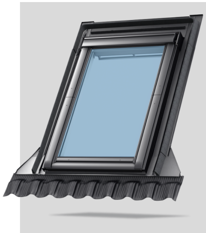
1 VELUX ROOF LIGHT FK06