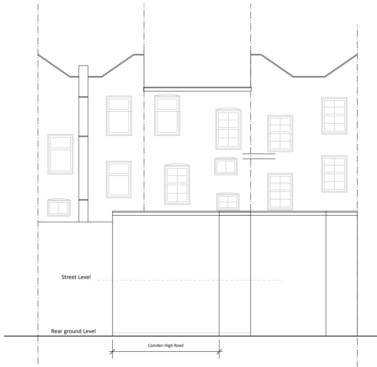
Existing Rear Scale: 1:100

This drawing is the property of Orb Property Planning Ltd and may not be reproduced, loaned or copied, in part or in full, without the prior written consent of Orb Property Planning Ltd. This drawing is not for construction purposes, unless otherwise stated. The Contractor is responsible for checking all dimensions before any work starts or any materials are ordered. Any discrepancies must be brought to the attention of Orb Property Planning Ltd immediately.