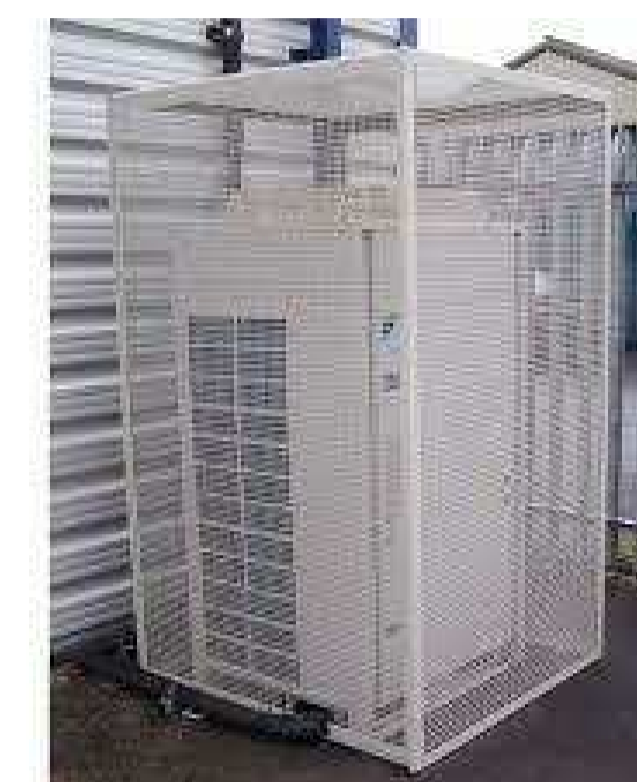
Typical Cage Example

2100mm High Galvanised mesh cage protection to adjacent extents - 7300 x 1500mm Inclusive of full height lockable mesh gates to provide access as required. Plant mesh to be 3 sides only - No lid. Fine Mesh Gauge and specification TBC. Bin Store to be Subcontractor Design