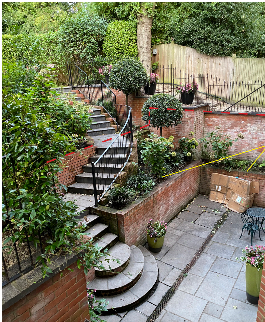
existing rear garden

line of existing retaining wall to be preserved (dotted red)