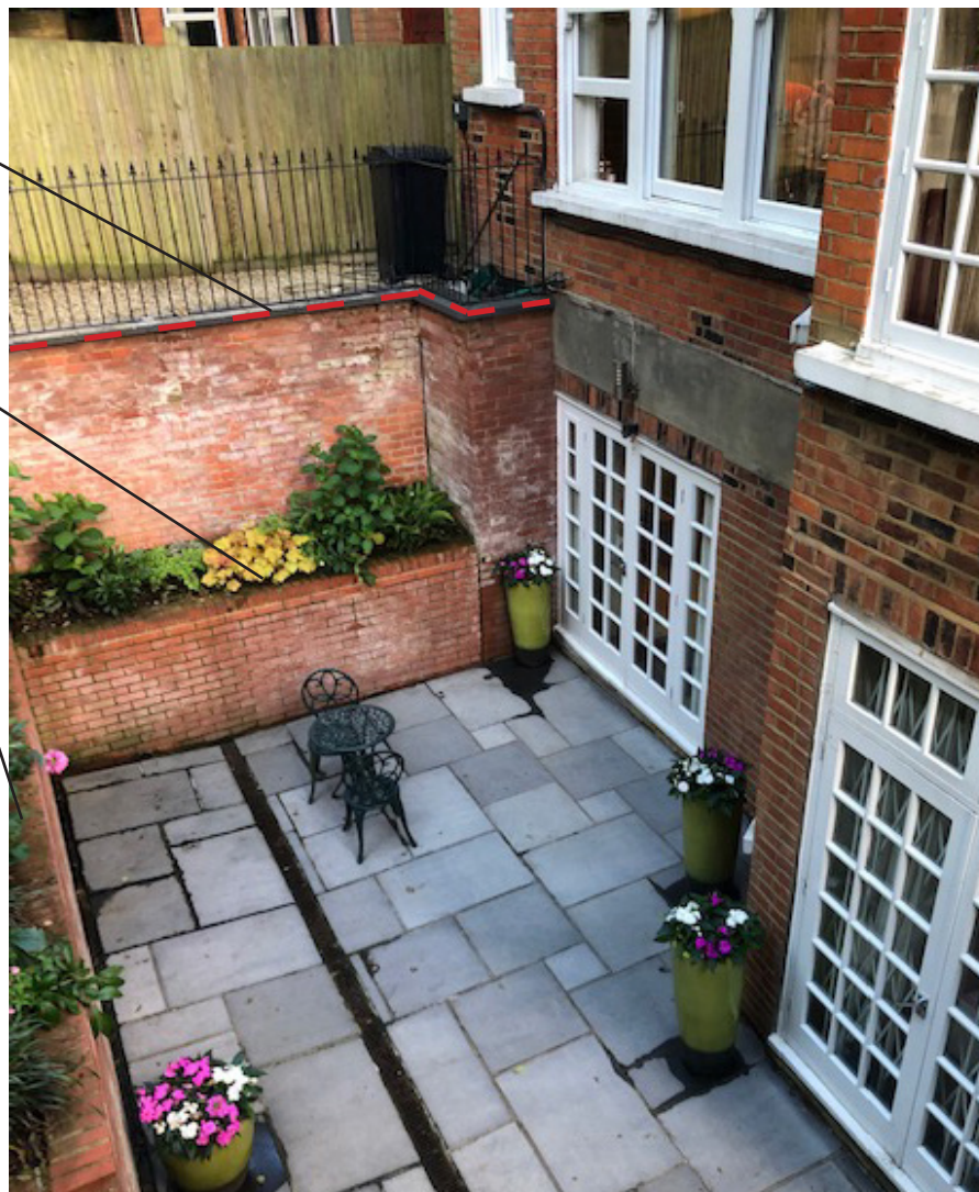
existing rear garden

line of existing retaining wall to be preserved (dotted red)