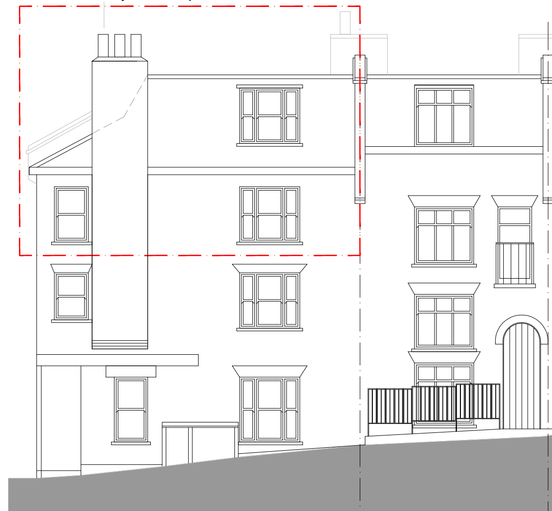
Proposed Side Elevation Scale 1:100