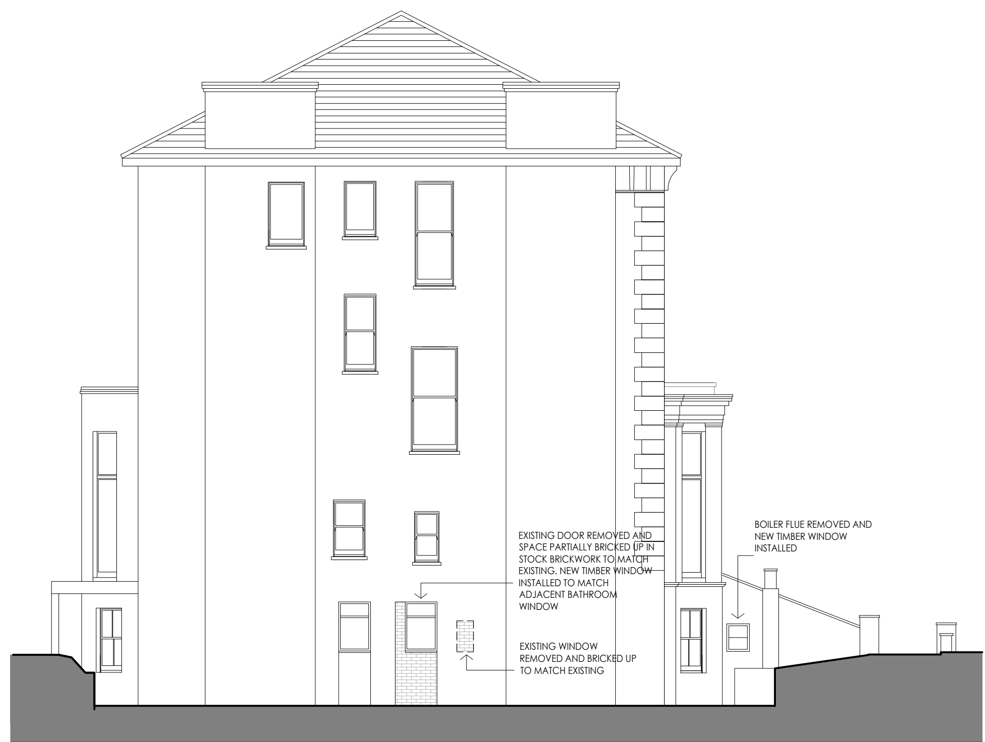
SIDE (WEST) ELEVATION EXISTING