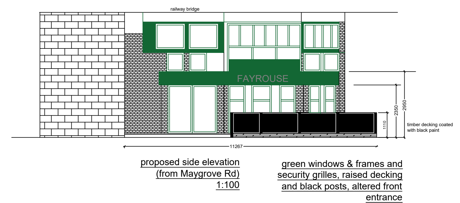
proposed side elevation (from Maygrove Rd) 1:100

green windows & frames and security grilles, raised decking and black posts, altered front entrance