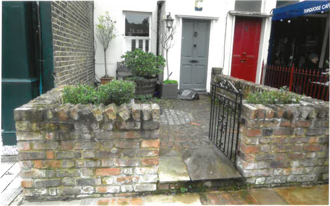
existing garden wall.