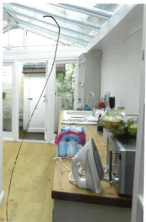
Remake rear glazing