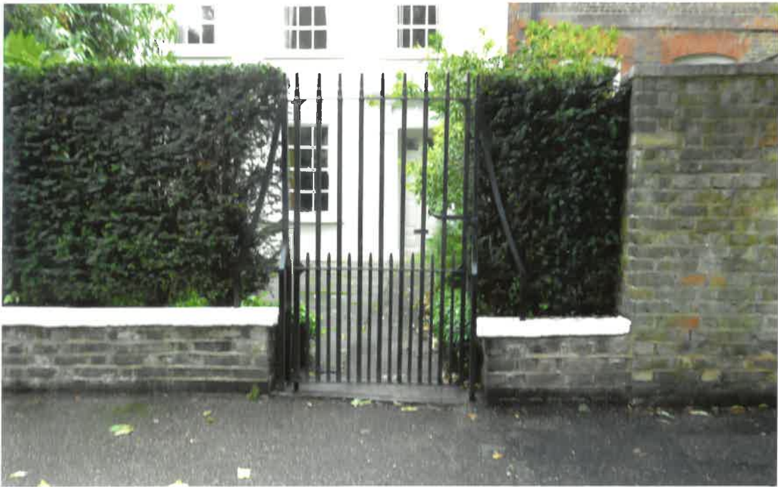
model for new garden wall.