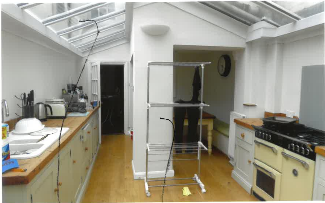
Turn Flat roof.