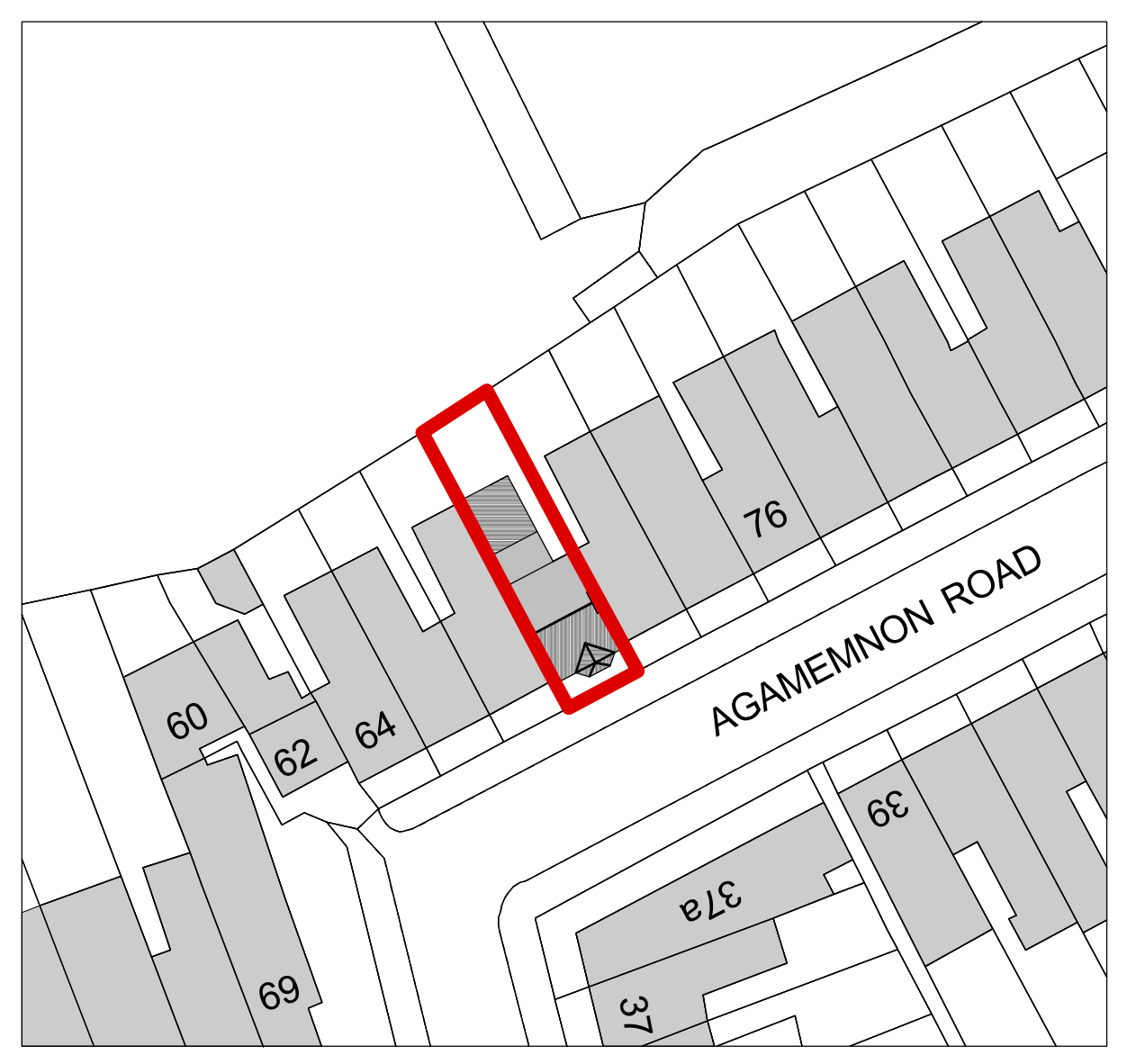
Existing Block Plan Site boundary outlined in red