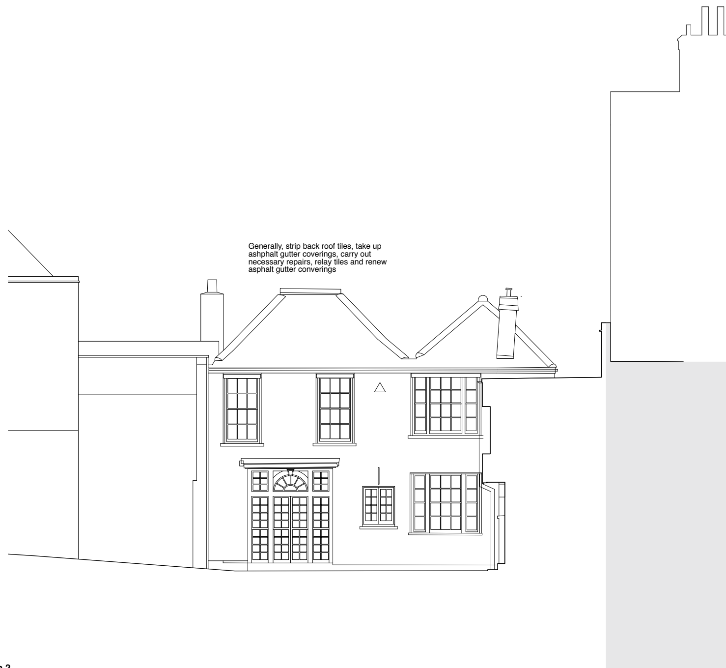
Proposed West Elevation 2