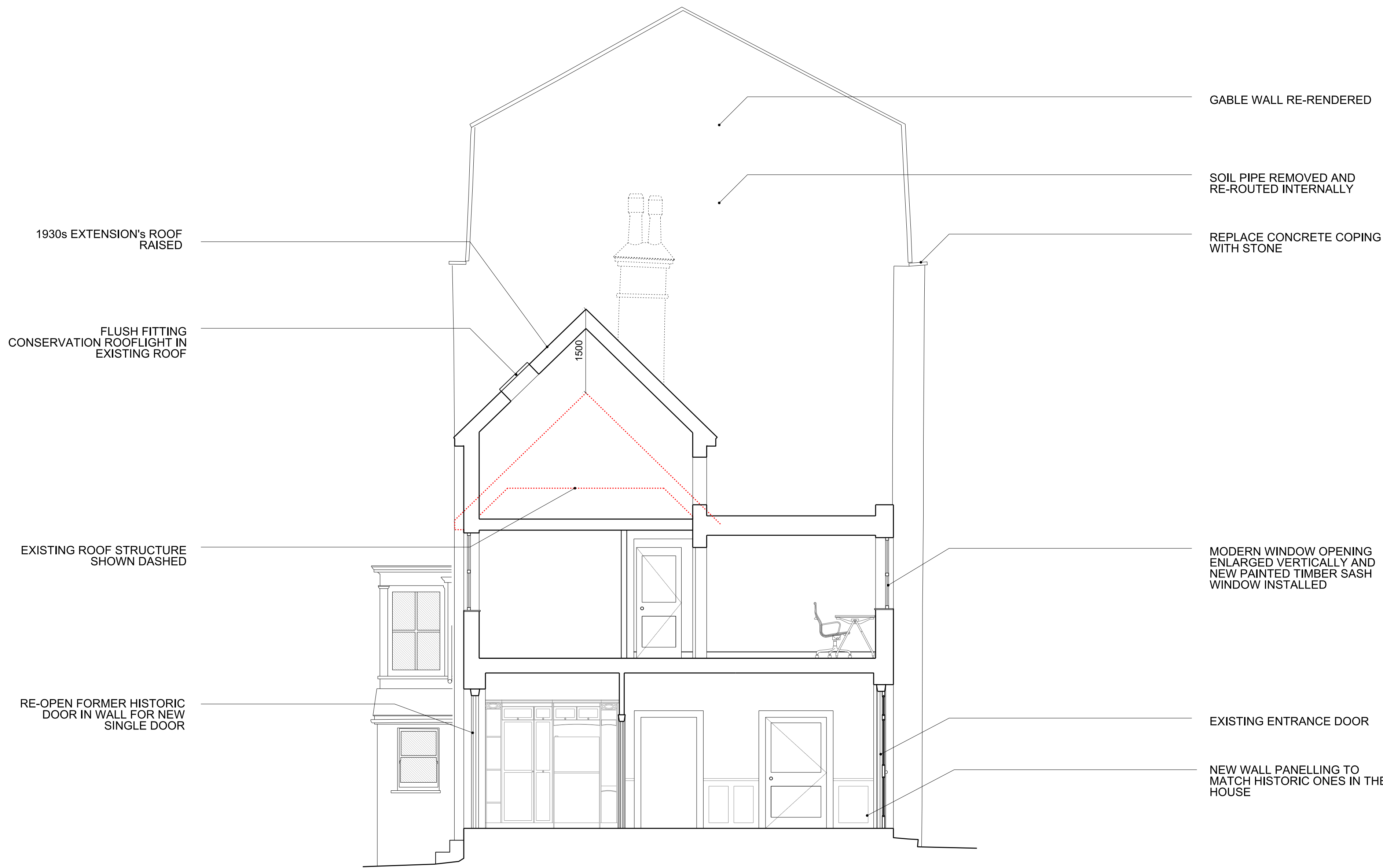
1 1:50 SECTION AA PROPOSED

EXISTING CEILING/ROOF/CHIMNEY LINE TO BE DEMOLISHED