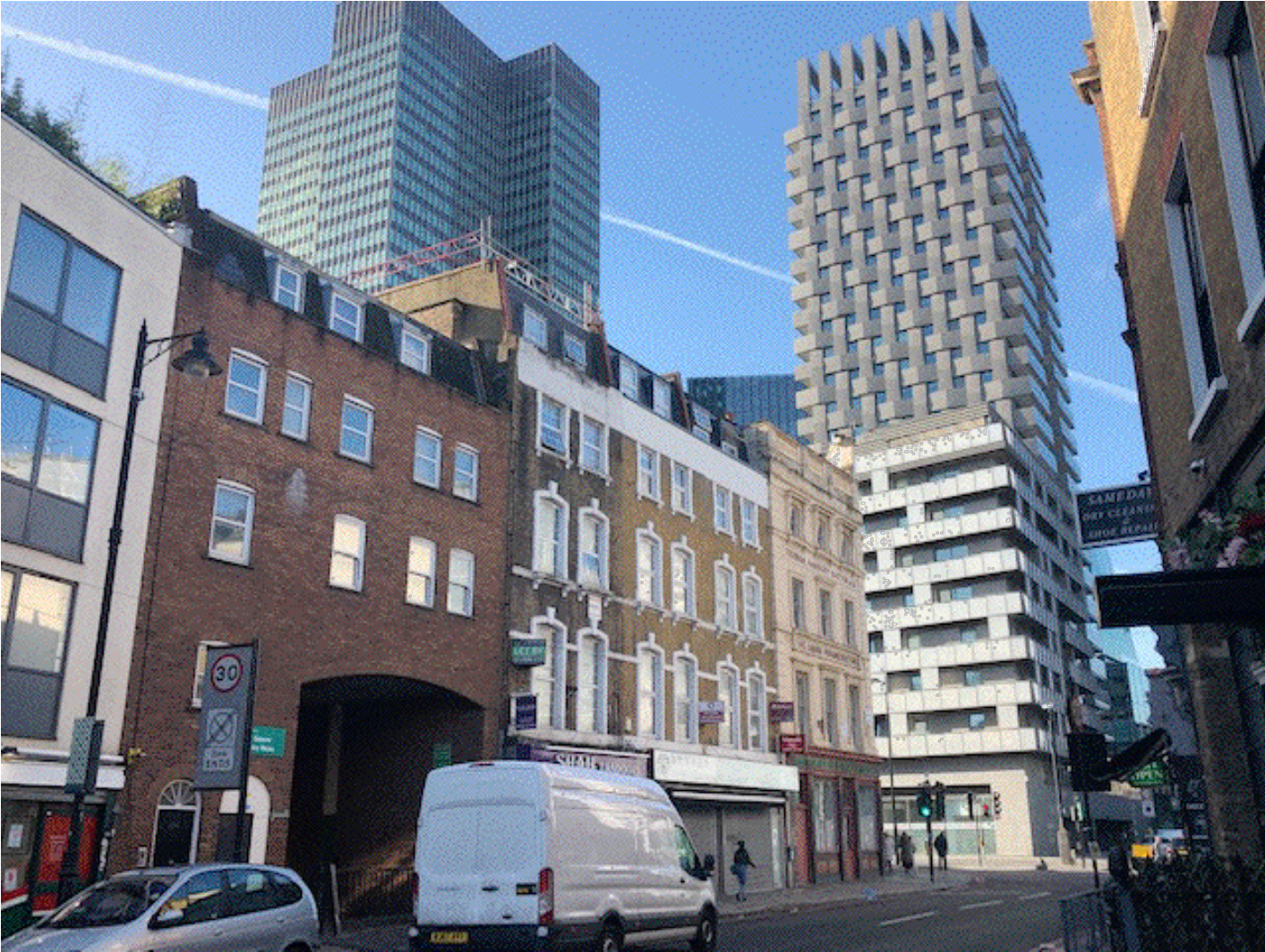
155 Drummond Street - from Drummond Street.

PROJECT 155 DRUMMOND STREET LONDON NW1 2FB