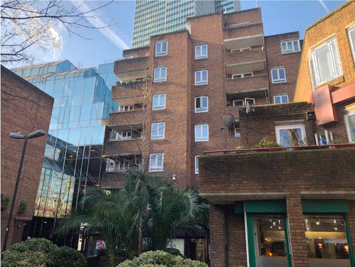
Gateway-D - from Tolmer's Square Estate.