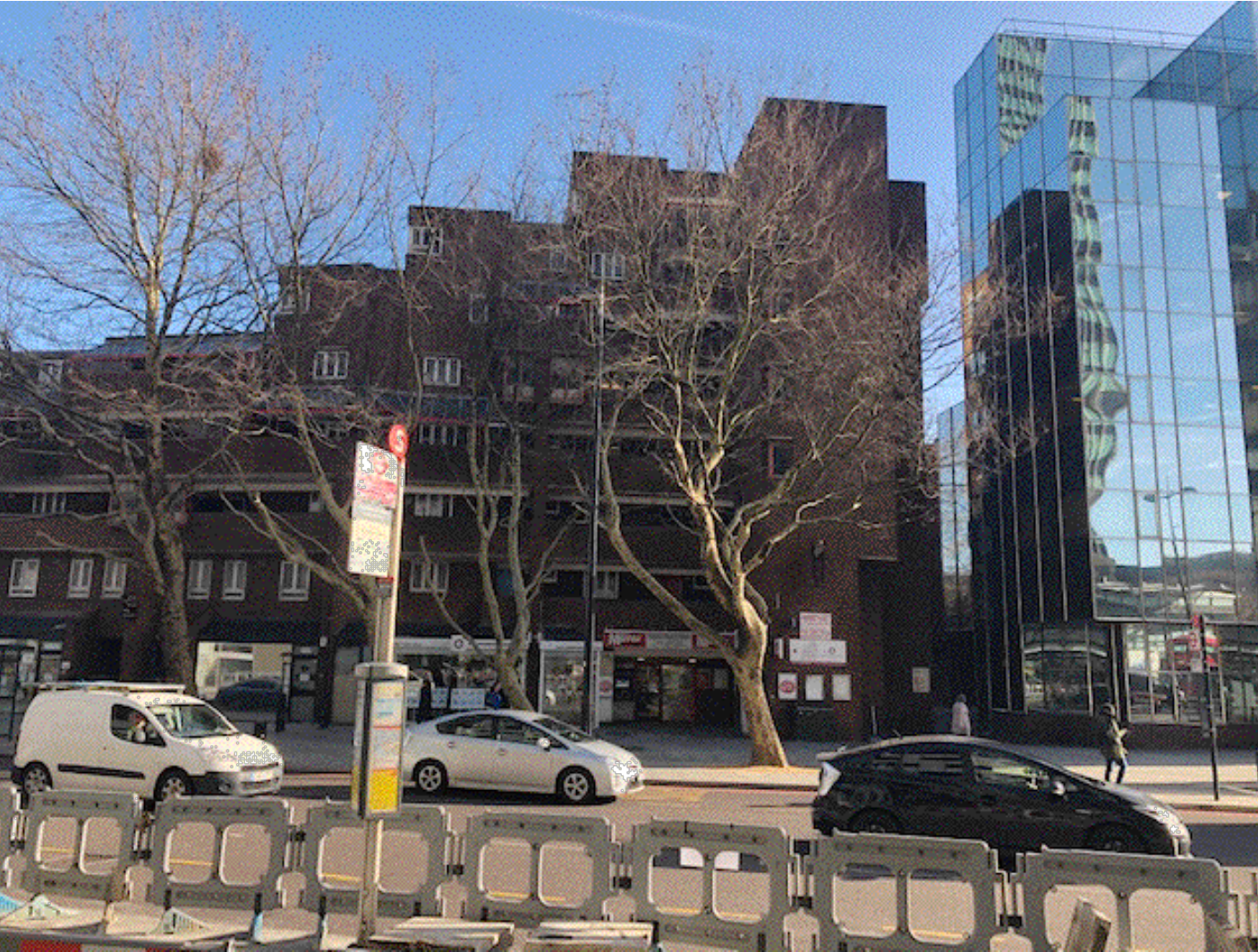
Gateway-D - from Hampstead Road.