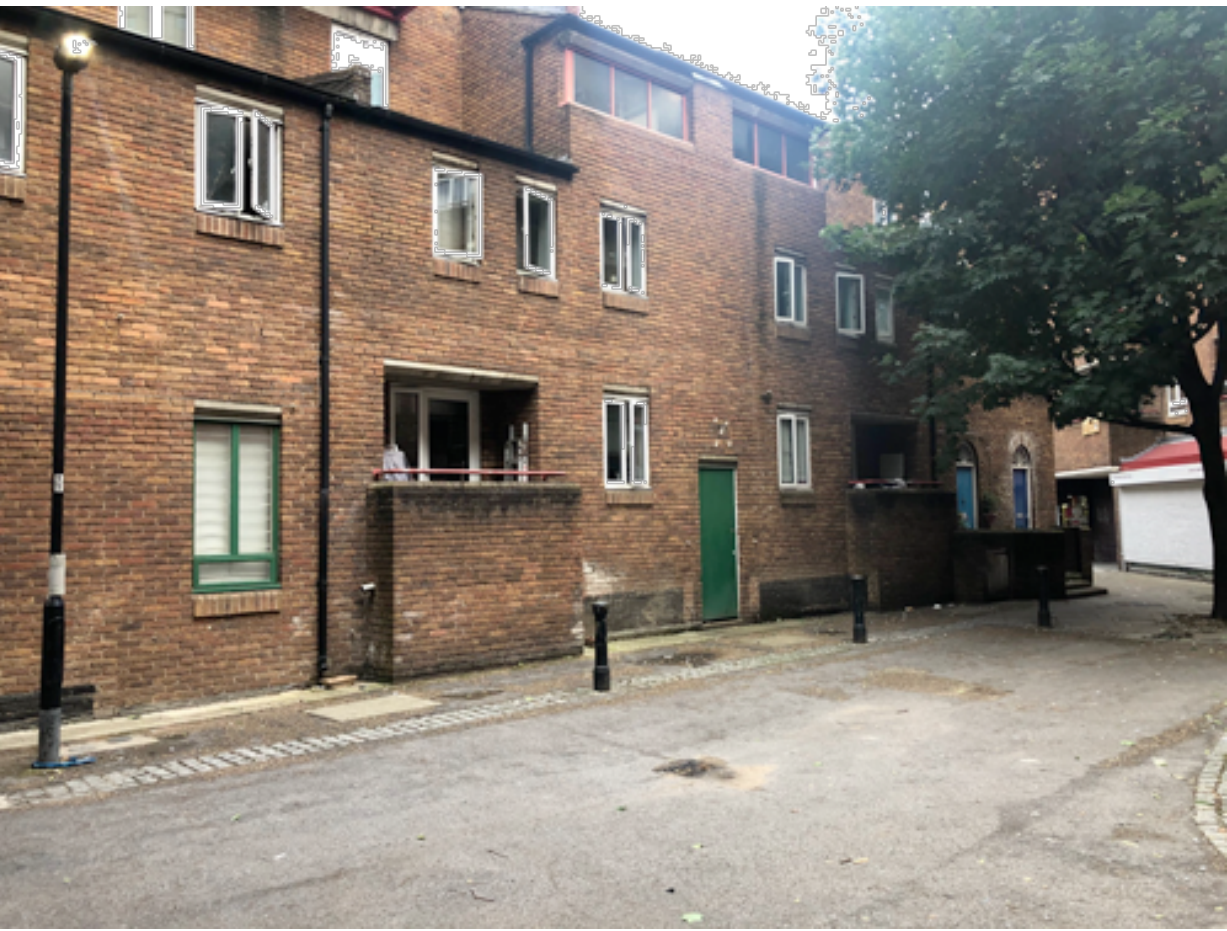
Foundry Mews - looking east.