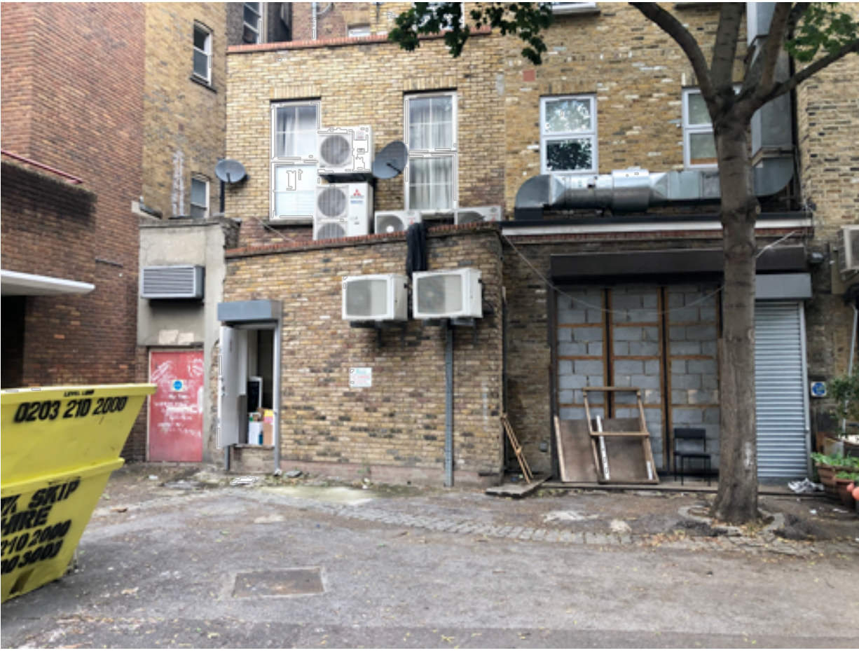
Foundry Mews - looking towards Drummond Street.