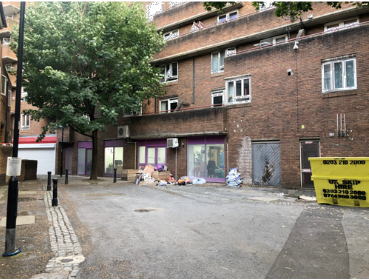
Foundry Mews - looking west.