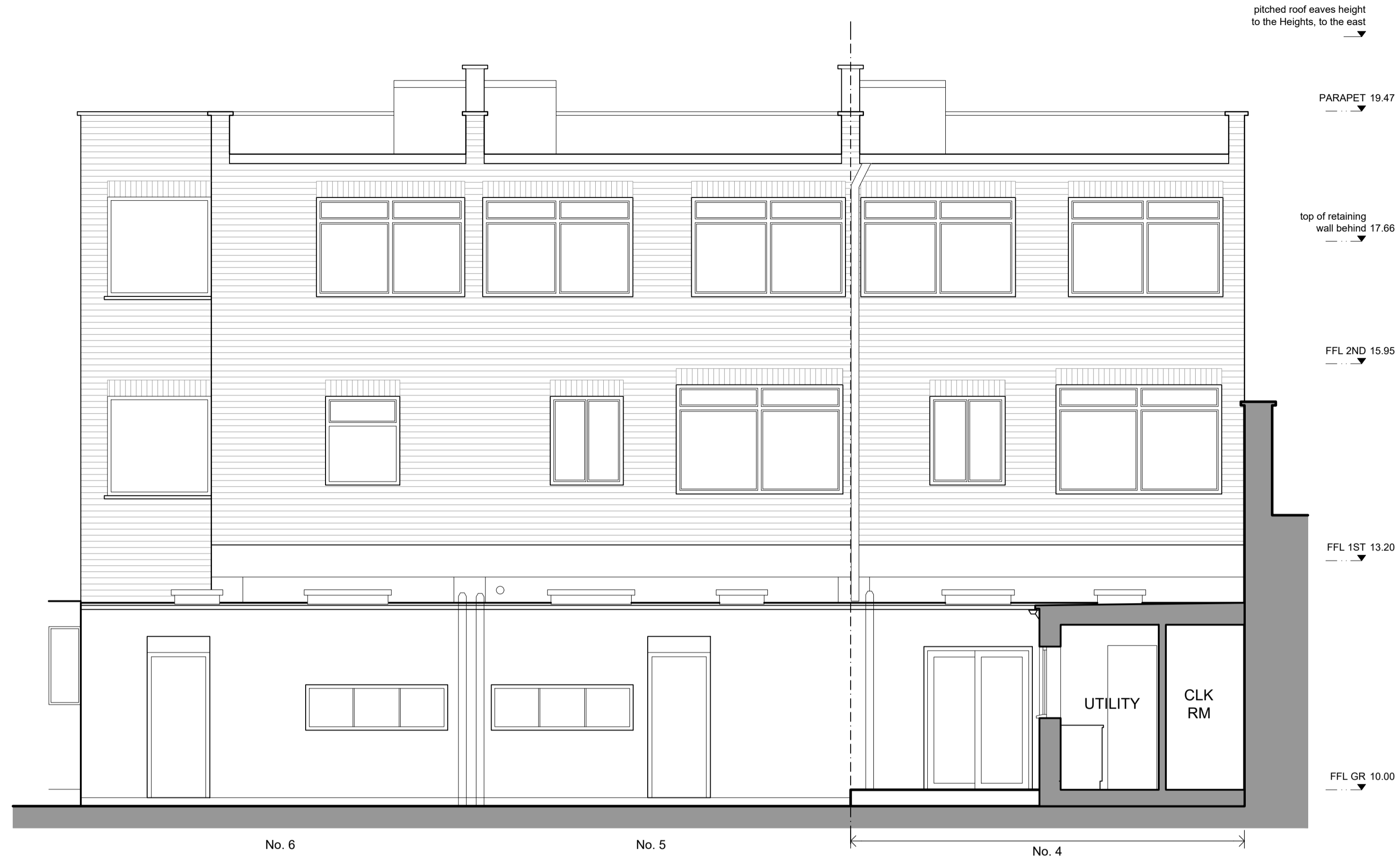
1 EXISTING NORTH ELEVATION (SECTION CC) A1 @ Scale: 1:50